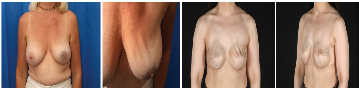
Fig. 1: Demonstrating the grading of rippling. Grade 3: Moderate degree of rippling seen at both rest and exercise. Grade 4: Persistent rippling causing gross deformity. Bra can cause impressions on the breast as seen in this patient.