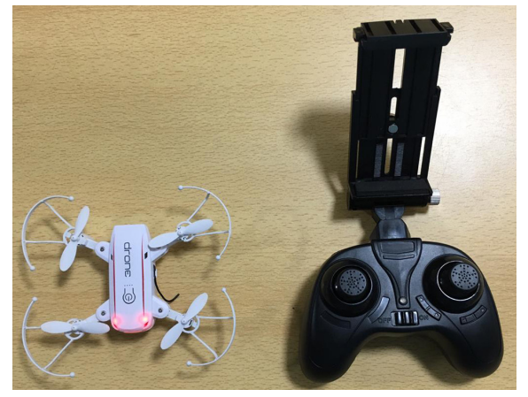
Fig. 1: Nano-drone with console.