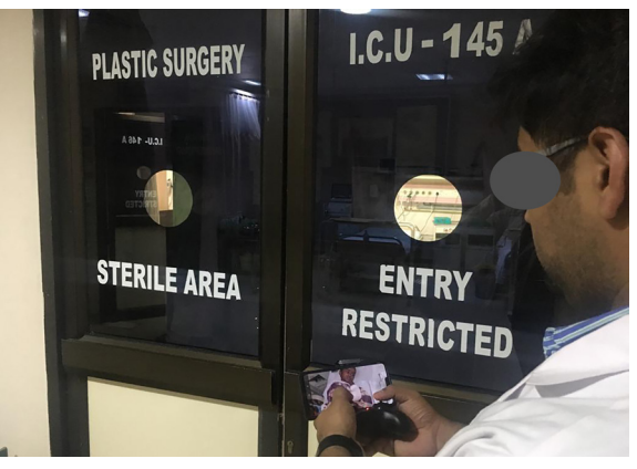
Fig. 4: Patient being monitored outside the ICU using the drone.

as well as a rechargeable battery. The phone/ monitor could be attached to the console. The flight range of the drone was 30 meters. The doctor who wanted to monitor the patient used the console to direct the drone into the patient's room to view the patient's vitals in the monitor, and only if required the doctor went inside to intervene (Figures 2-4). The drones were operated by six surgeons to monitor the patients in the ICU. One day basic training about the drain operation and functions was given by a trained executive. Feedback was taken from the person using the drone, and all six found the experience to be extremely satisfactory (Figure 5).