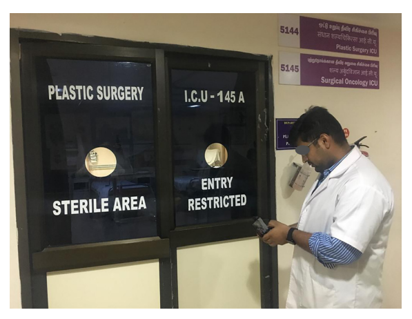
Fig. 2: Drone being operated by the doctor outside the ICU.

The drone's camera was 2 megapixel HD, which could be adjusted manually. It also had a console which could be used to control the drone