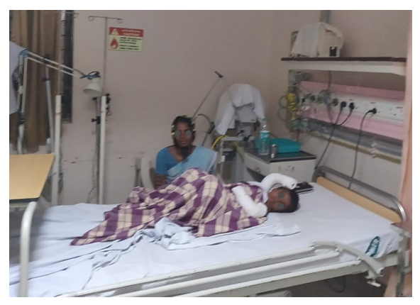
Fig. 3: Drone monitoring a post-operative patient in the ICU.