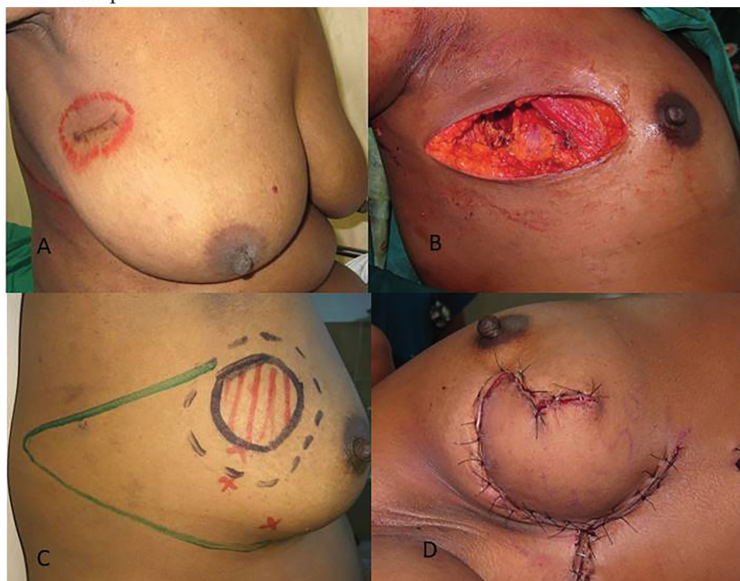
Fig. 2: A. Scar of excision biopsy for a right breast lump at a primary center with margin status unknown. B. Defect after excision of tumor along with overlying skin. C. Pre-operative marking of The LTDF flap. D. Final result after the LTDF flap has been transposed to provide skin as well as soft tissue coverage.