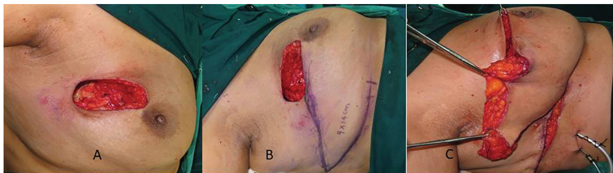
Fig. 1: A. The defect after the tumor is resected as per oncological principles. Skin is not involved. B. A wedge shaped lateral thoracodorsal flap is marked with the infra-mammary fold forming its axis. C. The flap is advanced, the skin de-epithelialized to provide bulk to the defect.

Extra care is taken not to breach the fascia at the junction of latissimus dorsi and serratus anterior muscle. The flap was transposed in the defect and the symmetry of mound