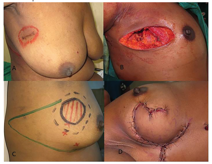
Fig. 2: A. Scar of excision biopsy for a right breast lump at a primary center with margin status unknown. B. Defect after excision of tumor along with overlying skin. C. Pre-operative marking of The LTDF flap. D. Final result after the LTDF flap has been transposed to provide skin as well as soft tissue coverage.