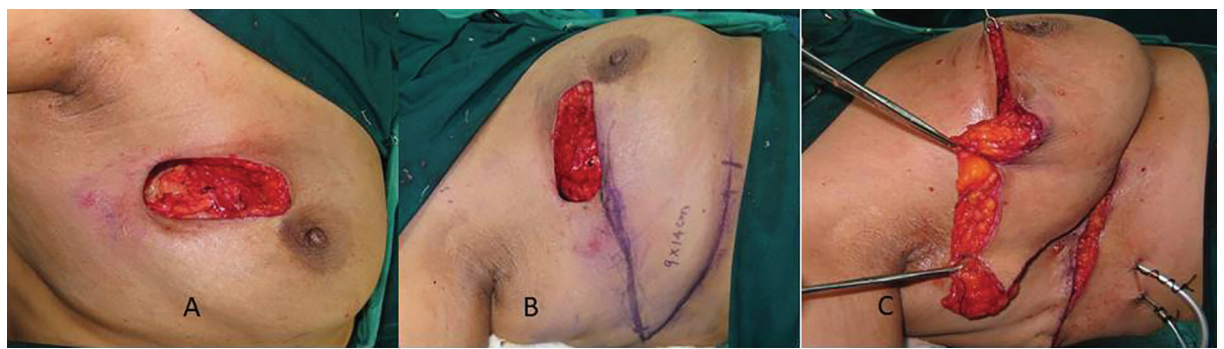
Fig. 1: A. The defect after the tumor is resected as per oncological principles. Skin is not involved. B. A wedge shaped lateral thoracodorsal flap is marked with the infra-mammary fold forming its axis. C. The flap is advanced, the skin de-epithelialized to provide bulk to the defect.

Extra care is taken not to breach the fascia at the junction of latissimus dorsi and serratus anterior muscle. The flap was transposed in the defect and the symmetry of mound