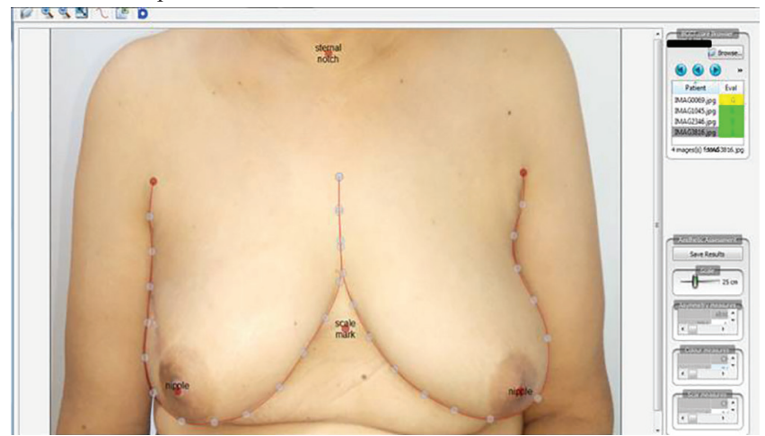
Fig. 4: Use of Breast Cancer Conservation Treatment (BCCT) core software 18 to assess cosmetic outcome.