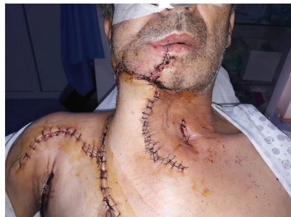
Fig. 3: View of patient, 1 week after surgery.

In the postoperative period, the correct occlusion of the teeth was confirmed by the assessment of the oral cavity and computed tomography. The viability of the skin-muscle flap of the pectoralis major muscle was assessed using clinical monitoring, checking the flap every four hours for the first 3 days (Figure 4). After 6 months, a flap pedicle was remodeled (Figure 5A and B)