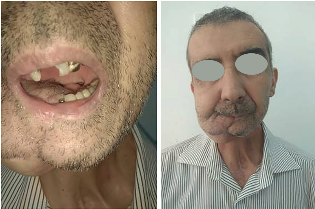
Fig. 5: Intraoral (A) and extra oral (B) view of patient after remodeling pedicles of pectoral major and deltopectoral flaps.

presence of at least three screws fixing the plate for each segment of the lower jaw avoids the dislocation of the residual mandible and guarantees the maintenance of the jaw profile and the correct occlusion of the teeth. The main role in the reconstruction of the lower jaw was played by the anatomical features of the localization of the defect. The muscular-dermal flap of the pectoralis major muscle has been used in a variety of reconstructive procedures of head and neck, which may include covering mucosal defects and skin defects. 4-6