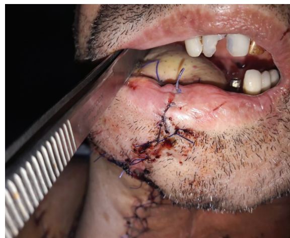
Fig. 4: PMMF insert to oral site of oromandibular defect.