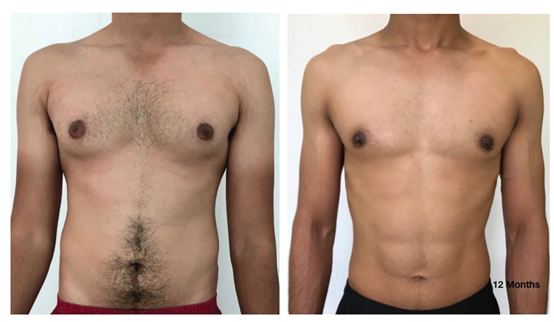
Fig. 2: Pre and post-surgery (12 months) photos, grade 1T.