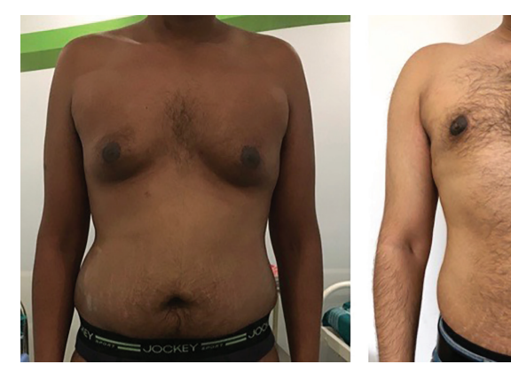
Fig. 5: Pre and post-surgery (8 months) photos, bilateral grade IIBL.

is credited to Paulas Aegineta (625–690 AD), a Byzantine Greek physician.<sup>8</sup> Webster in 1946 described semicircular intra-areolar incision. Current surgical techniques favor standard liposuction/suction-assisted lipoctomy (SAL) and ultrasound-assisted liposuction (UAL) with a combination of removal of breast tissue, with the advantage of tackling both the fat and the breast tissue. Surgery should be considered in patients with cosmetic concern, discomfort, psychological stress and longstanding gynecomastia (>12 m).<sup>9</sup>