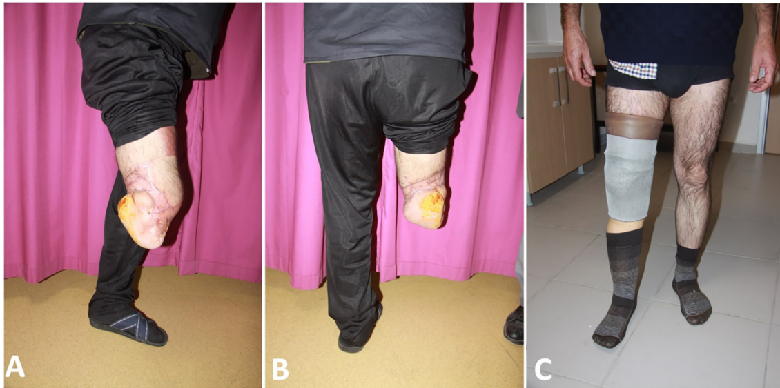
Fig. 3: A. Lateral view of the reconstructed below knee stump. B. Posterior view of the reconstructed below knee stump. C. Standing position of the patient with prosthesis.

extremity is a serious challenge for a surgeon in terms of medical ethics. 4,5 Therefore, some criteria have been reported in the literature for standardization of amputation decision. “The Mangled Extremity Severity Score” reported by Johansen et al. is one of them. According to this score, severity of the injury (Low – Very high energy: 1-4), limb ischemia (Pulse reduction - Cold, paralytic, 6 hours past: 1-3), shock (Systemic blood pressure \geq 9 mmHg: 0 -persistent hypotension: 2) and age (under 30 years - 50 years and older: 0-2) parameters were scored. Direct amputation was recommended, if this score was 7 or more. 5