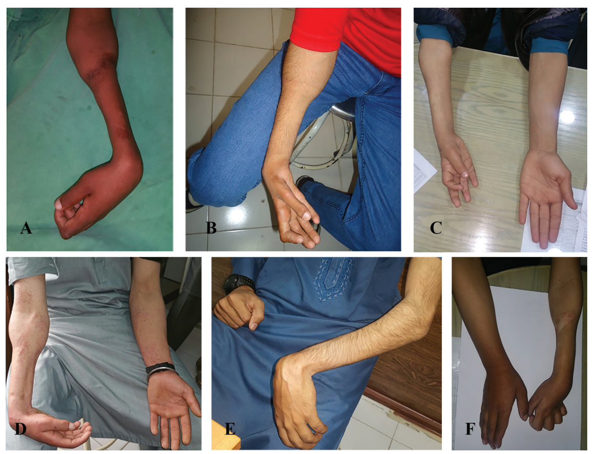
Fig. 2: A: The left forearm of a 16 years boy with severe VIC showing the characteristic demarcation with normal muscle bulk in the proximal one third and circumferential atrophy involving distal two-thirds of the forearm. There is flexion contracture of the wrist. B: The right forearm of a 19 years adolescent male with severe VIC showing the circumferential atrophy of distal two-thirds of forearm. Flexion contractures of the fingers and wrist are visible. C: The right forearm of 17 years old boy who had sustained primary ischemic insult seven years ago. Remarkably there is global atrophy and shortening of the forearm and hand as compared to the contralateral normal side. D: The right forearm of a 20 years male with VIC of moderate severity. Flexion contracture of the wrist is appreciable. E: The left sided VIC in a 25 years old man with fixed flexion contracture of the wrist. F: Severe VIC involving the left forearm of 19 years adolescent. There is clawing because of the associated impaired median and ulnar nerves.