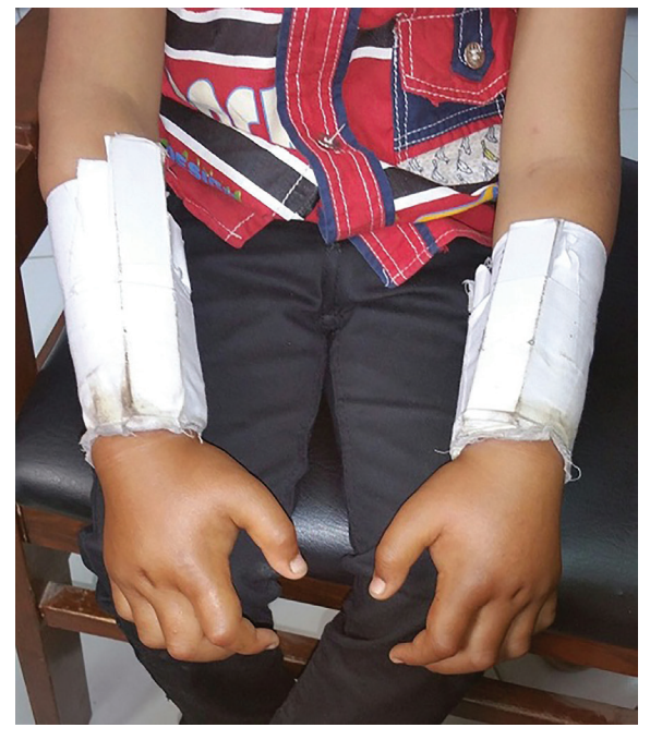
Fig. 1: This photograph demonstrates the typical method employed by traditional bone setters. They fix the fractures initially with brutal manipulation to reduce it, followed by putting bamboo sticks around the distal two-thirds of the forearm. These sticks are then surrounded by tight constricting bandages. The proximal one third of the forearm is characteristically spared. Swelling of the hands can be appreciated.

The underlying causes of the initial traumatic insults included application of tight bandages by traditional bone setters for fixing forearm fractures (n=31; 83.78%), high voltage electric burns involving hands/forearms (n=5; 13.51%) and supracondylar fracture with vascular compromise (n=1; 2.70%). The time interval