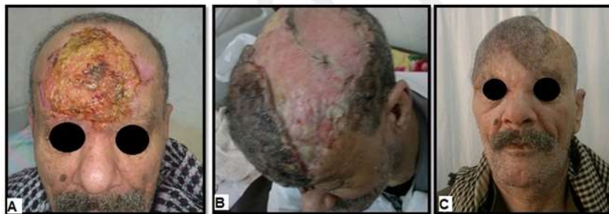
Fig. 3: A 65-year old male with BCC in the forehead (frontal area). A) Pre-operative view. B) Postoperative view shows covering of the secondary defect by STSG. C) Three months postoperative view shows good functional and esthetic outcome.