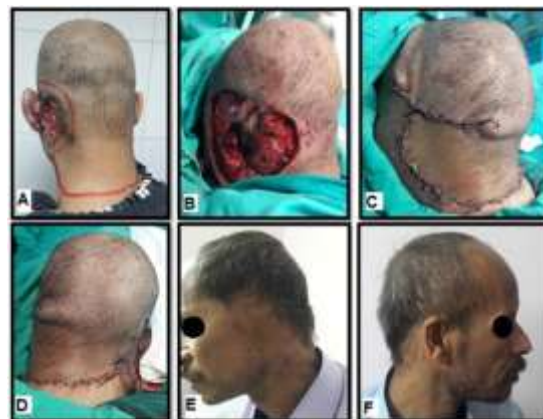
Fig. 1: A 42-year old male with BCC in the left temporo-occipital area, involving the ear. (A).Pre-operative marking of the flap and the adequate margins of the tumor. (B). Intra-operative view after the lesion was excised; the size of the defect was 140 cm 2 . (C).Intra-operative view shows flap harvesting and inseting. (D). Intra-operative view shows covering of the secondary defect by STSG. (E, F). Four months postoperative view shows good functional and esthetic outcome.

The follow-up period ranged from six to twenty-seven months (mean: 15.6 months). None of our cases had local recurrence or distant metastasis till the end of the follow-up period (Table 2).