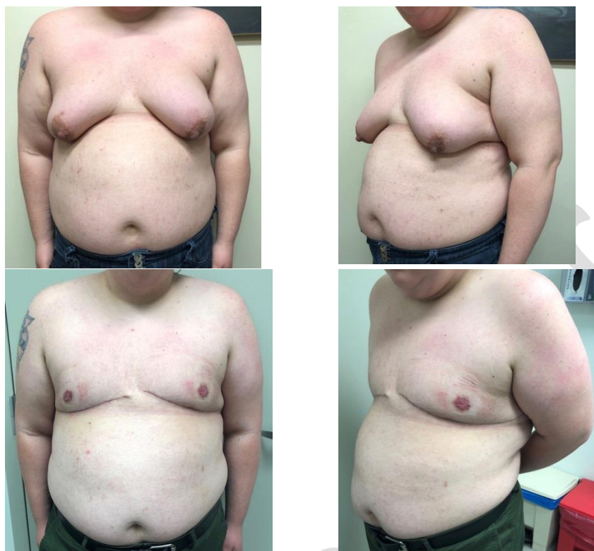
Fig. 2: 27-year-old FtM patient with a BMI of 40.31 kg/m 2 and C cup breasts with grade 3 ptosis. Anterior (A) and left lateral (B) preoperative photos. Weight of right and left mastectomy specimens were 197g and 675g, respectively. Anterior (C) and left lateral (D) at six weeks post operation which utilized an inframammary incision with lateral extension. There was loss of his left central areolar nipple graft managed conservatively with application of Santyl.