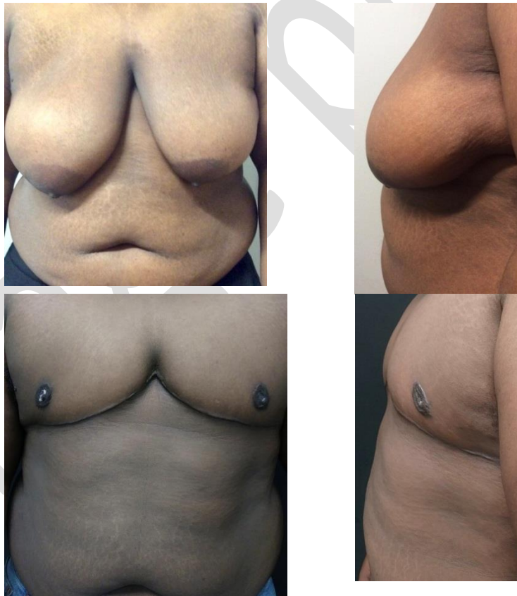
Fig. 1: 22-year-old FtM patient with a BMI of 40.62 kg/m 2 and D cup breasts with grade 3 ptosis. Anterior (A) and left lateral (B) preoperative photos. Weight of right and left mastectomy specimens were 1317g and 1048g, respectively. An inframammary incision with lateral extension was utilized. Anterior (C) and left lateral (D) at 11 wk post operation. There were no complications.

Additionally, we preferred the addition of a lateral extension of the inferior incision particularly in patients with poor skin elasticity, and Grade 2-3 ptosis. This technique was frequently utilized in this study given that the majority of our FtM patients fit into this categorization. A combination of surgeon experience and literature regarding breast reshaping in the post-bariatric surgery population motivated the adoption of this approach. Bariatric literature commonly references lateral extension of the Wise pattern for augmentation or mastopexy to correct lateral thoracic skin redundancy or “side rolls” 7-9 . With a similar goal of improving chest contouring in our patients, lateral extension of the inferior incision allows for resection of excess lateral chest wall skin to achieve further improved aesthetic outcomes of chest wall masculinization in obese FtM patients.