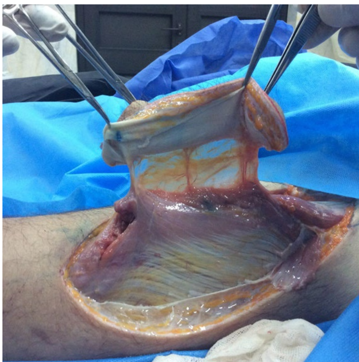
Fig. 2: Completion medial and lateral border of flap and perforators seen in flap