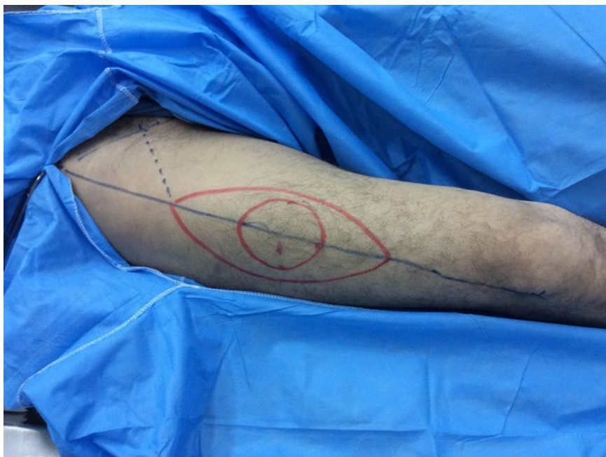
Fig. 1: Design of fusiform flap around a middle circle

The vessels supplying the skin are either