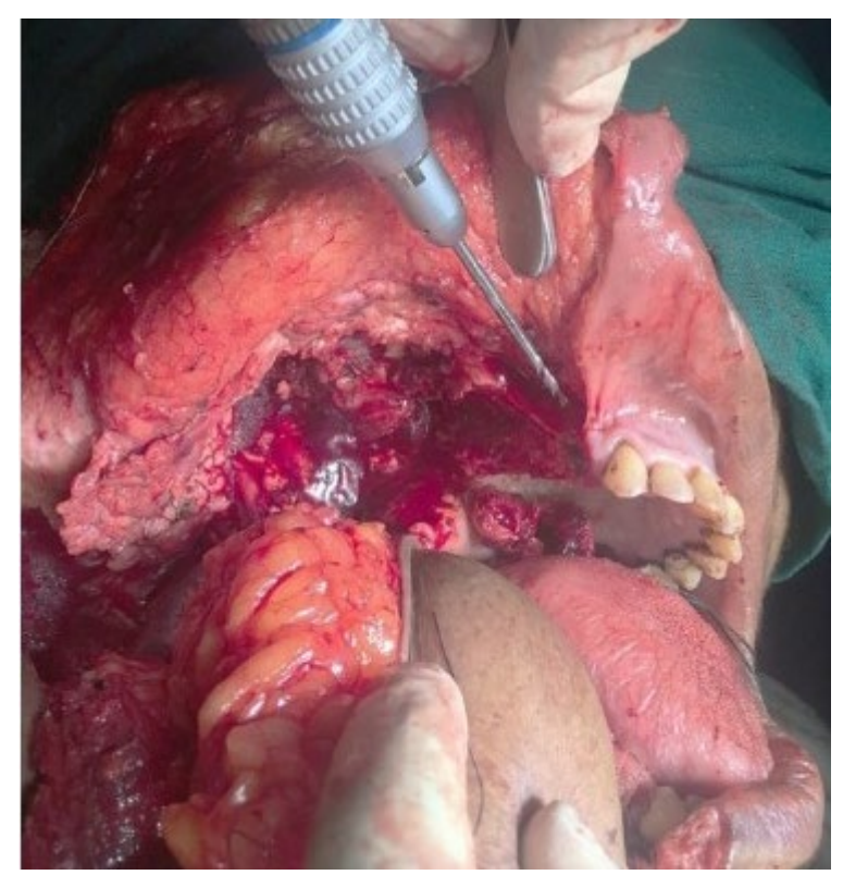
Fig. 1: Placing drill holes in the alveolus of Maxilla in Study group