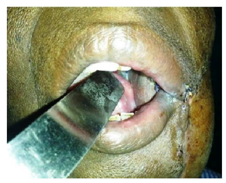
Fig. 4: Late post-operative view with well healed suture margin in Study Group