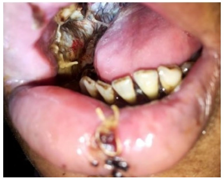
Fig. 3: Upper margin of flap disrupted in Control Group

In addition, factors like gravitational pull, vectoral forces and pull of muscle downwards may also be responsible for suture line disruption at the palatal margin. In one of our study group patients, the flap margin which was necrosed at the margin was debrided and re-anchored to the same drill hole, as there was adequate dimension of the remaining flap. Fistula formation might be associated with haemoglobin level <13 g/dl, serum albumin <3.4 g/ dl, and hypopharynx reconstruction<sup>7</sup>, which might also be one of the reasons behind the incidence