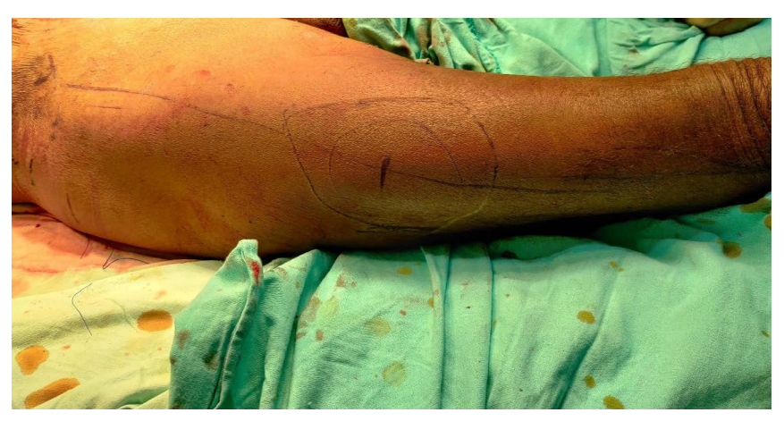
Figure 2: Markings of pedicled ALT flap