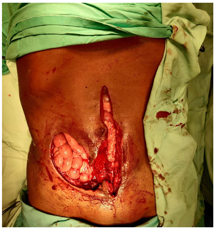
Figure 1: A 42-year-old patient operated for abdominal wall tumour. A full thickness defect of 14 x 8 cm after tumour resection

One patient developed abdominal wound infection in postoperative period and was treated with dressing and antibiotics.