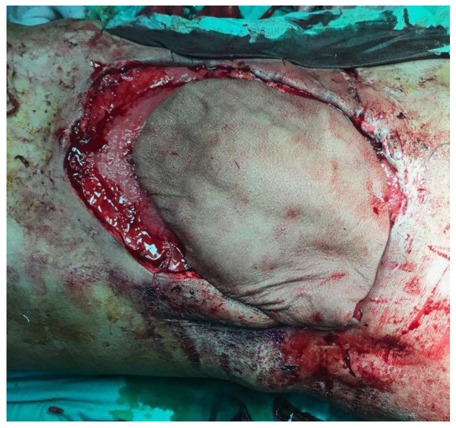
Figure 7: Patient was operated and defect covered with pedi cled ALT flap