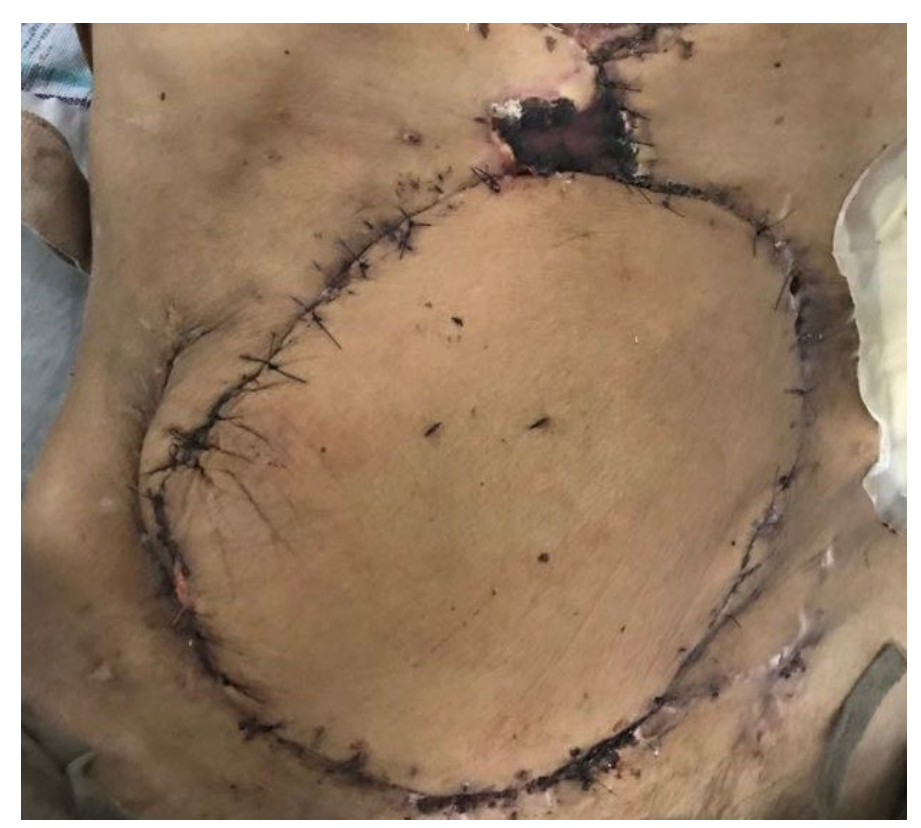
Figure 8: Post operative picture