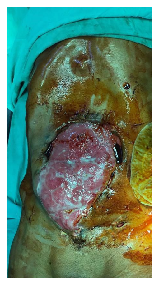
Figure 6: A 40-year-old patient with history of laparotomy for perforation, presented with abdominal wall defect of size around 25 x 18 cm.