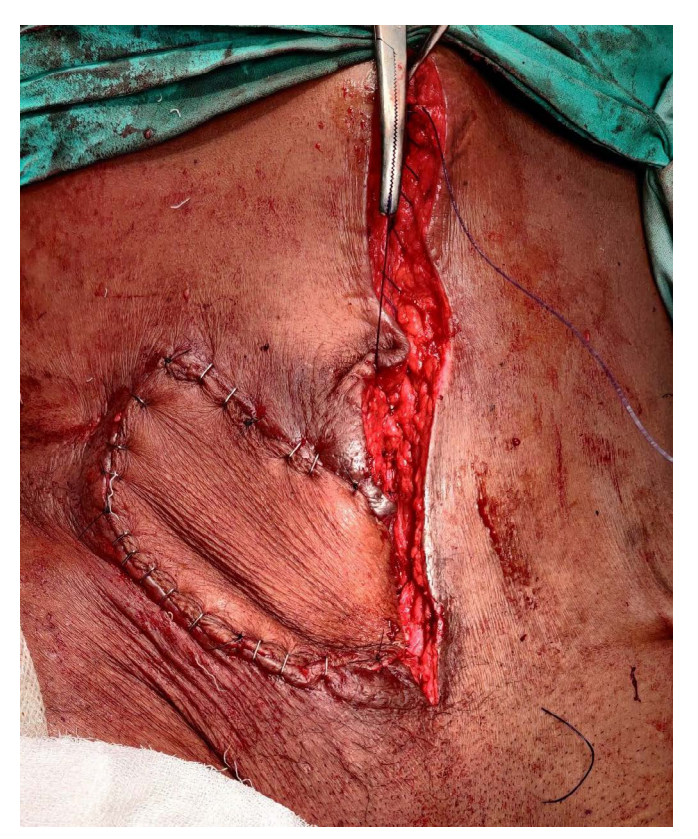
Figure 4: Flap after inset