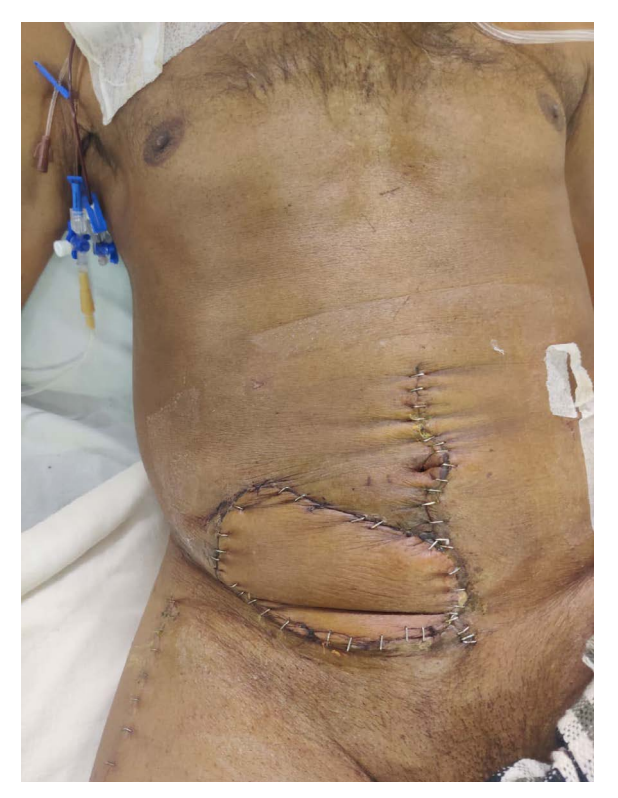
Figure 5: Post operative picture