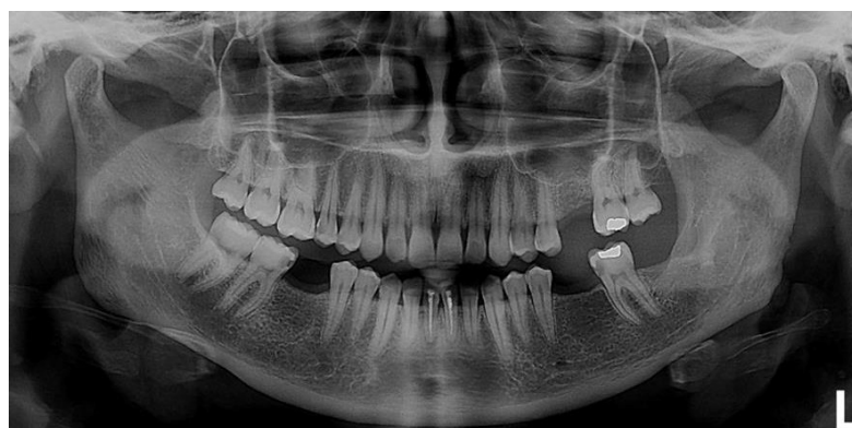
Figure 3: Final panoramic image.