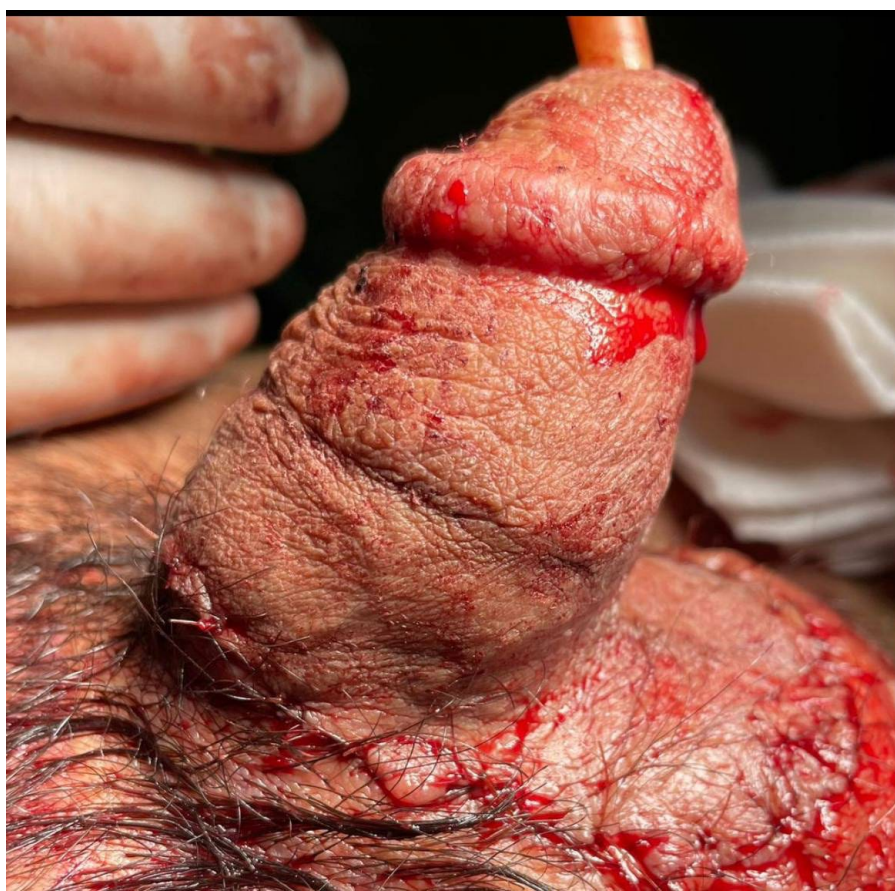
Figure 3: Just after penis re-implantation

There are various types of treatments to repair the amputated penis, which are both microvascular and macrovascular. The microsurgery methods have shown the best results 16 . Erich et al. first performed penile replantation by macrosurgery in 1929 and reported at least 30 successful cases of this method by 1970 17, 18 . In 1970, Cohen et al. successfully re-implanted the penis for the first time by microsurgery, after which this method was developed and used by a large number of surgeons 19 . The most difficult issue in the repair of this organ is the reconstruction of vessels, and among the arteries, the dorsal artery is the most important because it is highly effective in perfusion, and failure to repair it probably leads to distal necrosis 19, 20 . In this study, microsurgery was chosen because there was a good dorsal artery in the amputated penis, as well as a better prognosis for this method.