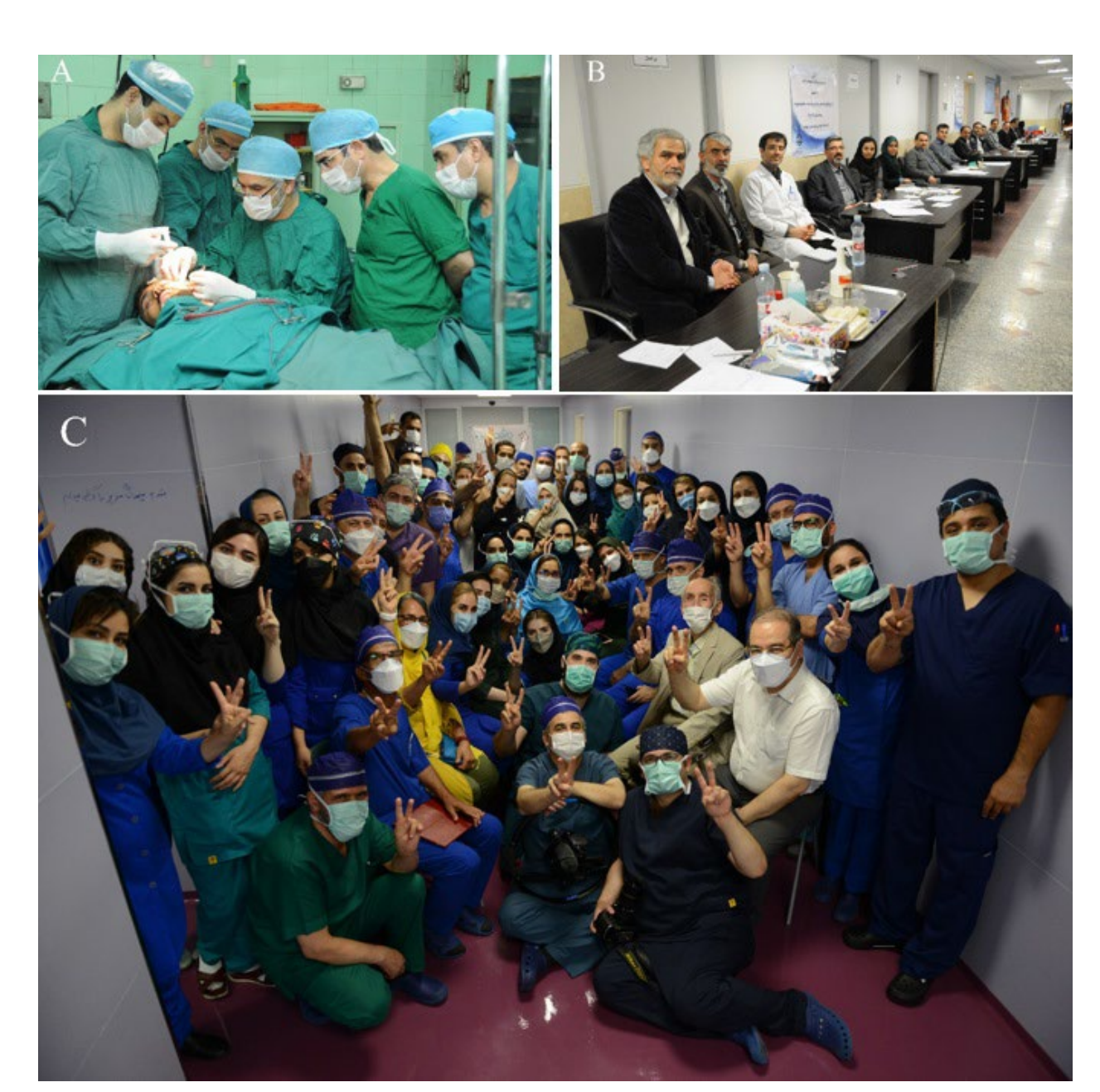
Figure 1: Our medical team. A. At the operating room, 1<sup>st</sup> mission (Ramhormoz, November 2009), B. Prepared for initiating medical visit, 11<sup>th</sup> mission (Bushehr, January 2014), C. At the operation room, 27<sup>th</sup> mission (Tehran, June 2021)

purposes and releasing their photos, as necessary. All medical staff appearing in the photos also provided written informed consent for publication of their photos.