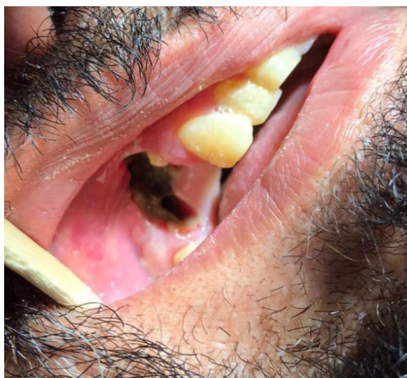
Figure 1: Clinical aspect of patient 1 CRONJ

The first diagnostic hypothesis was CRONJ. Exploratory surgery with local surgical debridement to remove necrotic bone tissue and revascularize the region has been suggested. Disagreeing with the team's decision, the patient eventually escaped the hospital center without receiving any treatment.