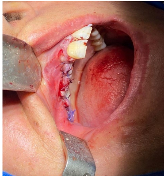
Figure 5: Immediate postsurgical aspect

teeth in the region had to be removed. A fragment as long as three teeth required no effort to remove (Fig. 4).