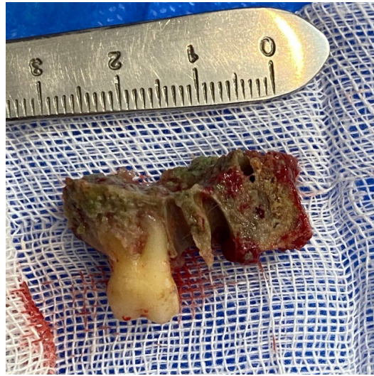
Figure 4: Sequestrectomy performed