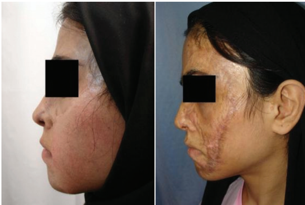
Fig. 2: The first patient before operation (Right) and after operation (Left).

have been very pleasant in terms of the beauty for both patient and his/her family, but also it has shown a significant improvement on the patient's appearance.