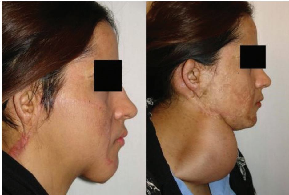
Fig. 3: The second patient before operation (Right) and after operation (Left).