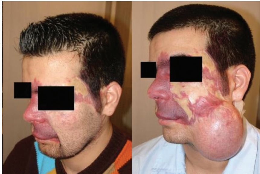
Fig. 5: The second patient before operation (Right) and after operation (Left).