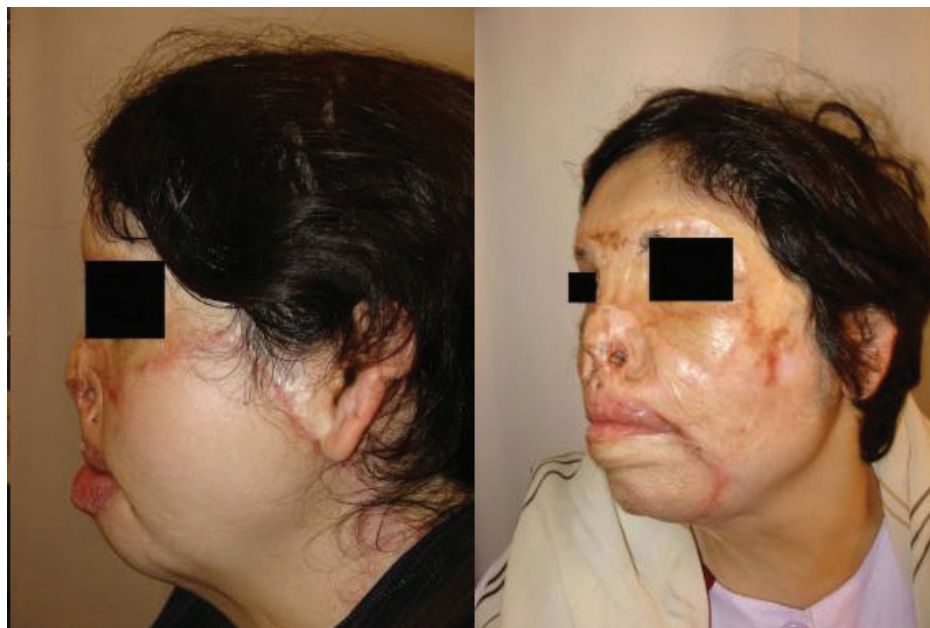
Fig. 4: The second patient before operation (Right) and after operation (Left).