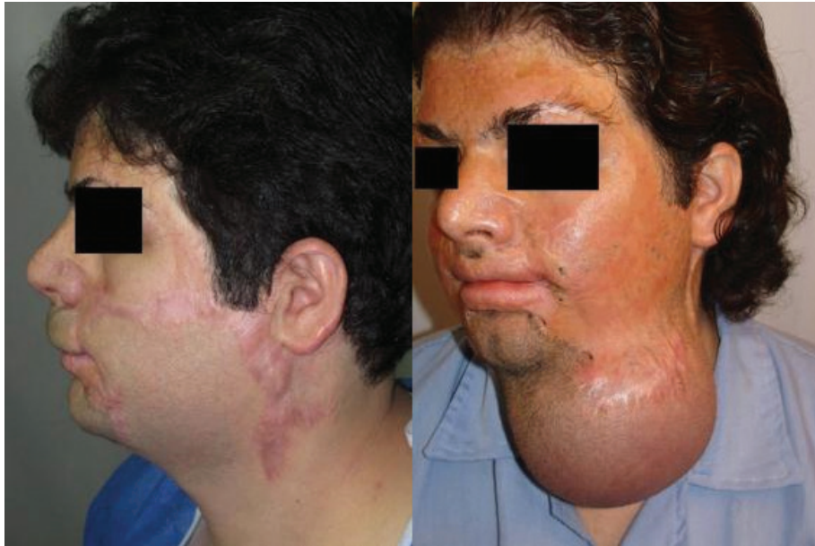
Fig. 8: The second patient before operation (Right) and after operation (Left).

prosthesis site infection (2.78%), leakage of the prosthesis (2.78%), hematoma (2.78%), and necrosis of the injection port site (2.78%). In the study by Bozkurt et al. , 21 the complication rate was estimated to be approximately 30%. Other studies have reported 1.22%, 20 4%, 21 and 5% 18 of infection rates. According to Spence et al. , the patients' complications included infection (5%), exposure of tissue expander (3%), tissue expander or injection port malposition (3%), shrinkage of tissue expander (7%), and loss of a part of the flap (3%). 18 Moreover, Kawashima et al. mentioned the complication rate to be 34.8%,