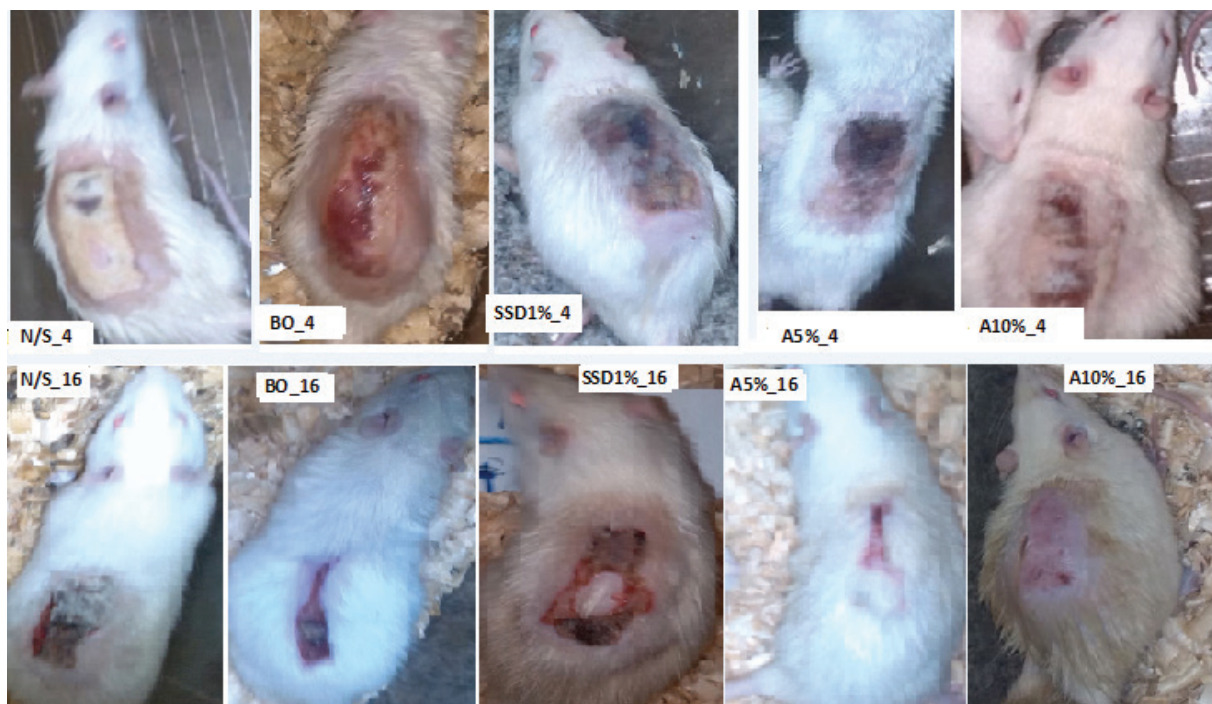
Fig. 2: Burn wound healing patterns in Normal saline (N/S), ointment Base (BO), 1% silver sulfadiazine (1% SSD) and 5 and 10% Arnebia euchroma ointment (5% A, 10% A) in rats after 4 and 16 days. Average wound size was smaller and the healing rate was faster in 5% A and 10% Arnebia euchroma ointment than other groups; p < 0.001 .

At the 7 th day of the experiment, histopathological evaluation showed the highest formation of granulation tissue for A. euchroma and the lowest extent for NS group (Table 5). The re-epithelialization parameter for 5% AEO treated group was significantly more than 1% SSD and controls groups ( p < 0.05 ) (Table 6). The collagen organization in 10% AEO group was better than 1% SSD and control groups on 21 st day. The score of collagen organization in 10% AEO, SSD, 5%