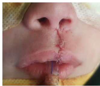
Figure 1: B. After surgery (Millard)