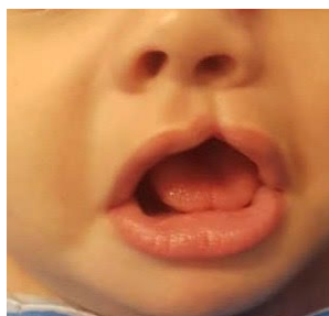
Figure 1: A. Before surgery

Figure 1 and 2 show the patients before the operation and the Sommerlad and Millard technique.