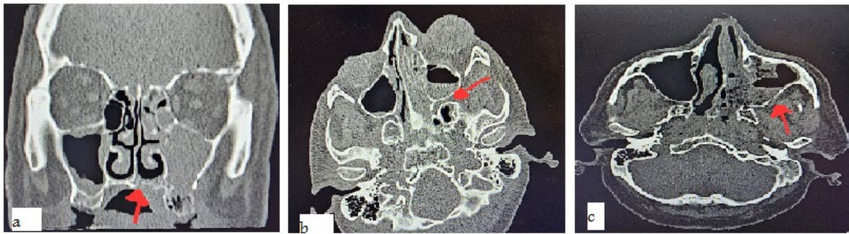
Figure 1: a) Hard palate erosion, b) Left pterygopalatine fossa involvement; c) Left posterior maxillary wall erosion