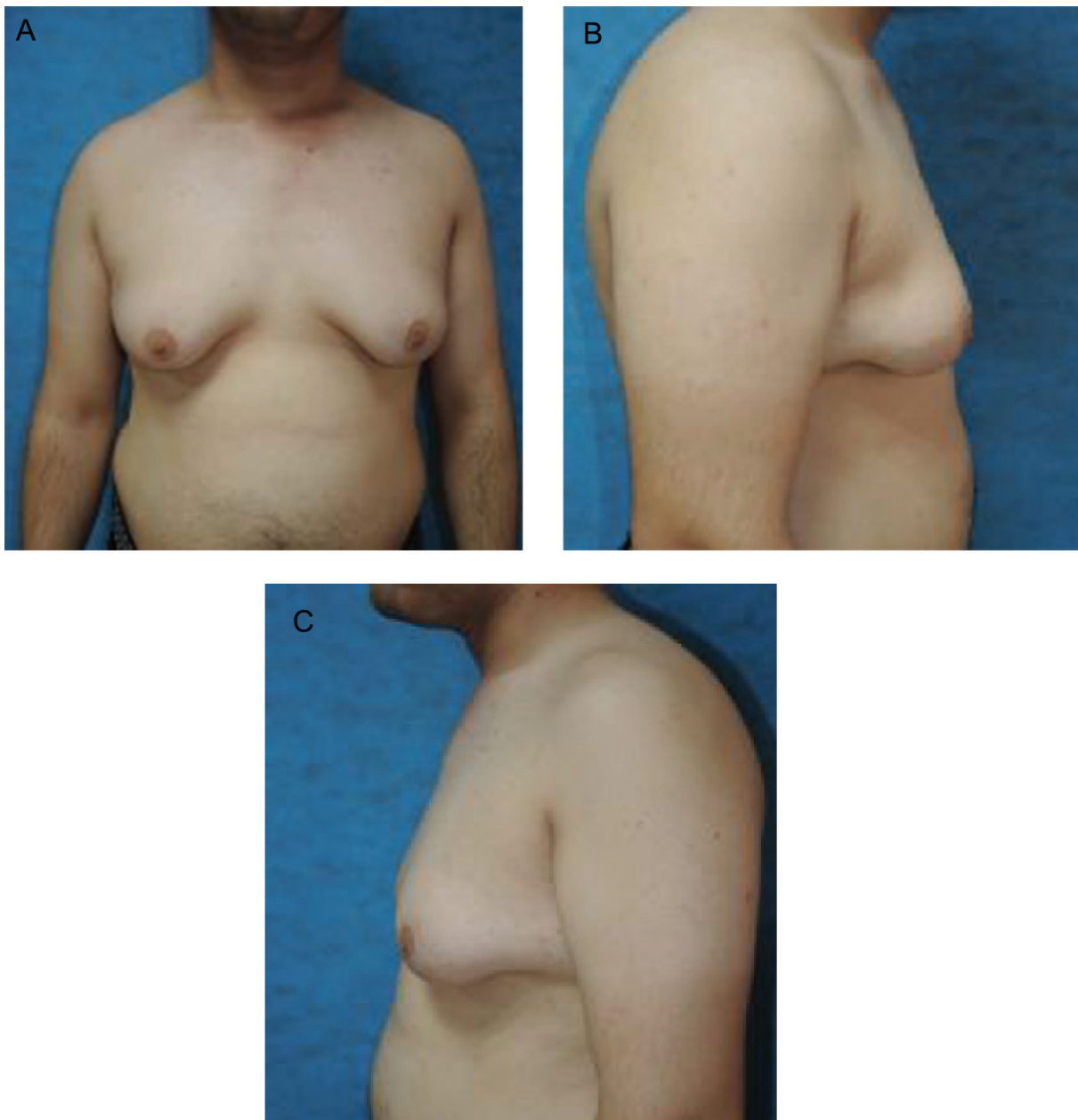
Fig. 1: A) Preoperative view (AP). B) Preoperative view (right). C) Preoperative view (left).

A married man aged 24 years was referred in 2014 for gynecomastia to the clinic affiliated to Department of Plastic and Reconstructive Surgery, Shahid Modares Hospital, Shahid Beheshti University of Medical Sciences, Tehran, Iran. His medical history denoted to an initiation in 2011. He was treated for bilateral undescended testis (UDT). According to operation notes, laparoscopy was performed and right orchiectomy and left orchiopexy were done for him. Azoospermia was confirmed for him in 2012. Because of delayed puberty, loss of body and facial hair, azoospermia and etc., the patient referred to an endocrinology clinic and