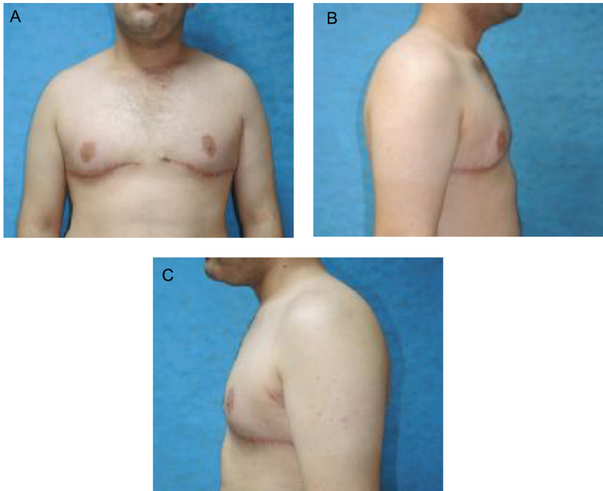
Fig. 3: A) Postoperative view (AP). B) Postoperative view (right). C) Postoperative view (left).