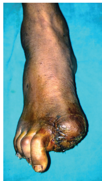
Fig. 2: Postoperative photograph after digital amputation.