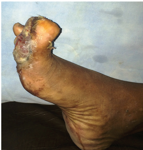
Fig. 1: Ulceroproliferative lesion of the left great toe.