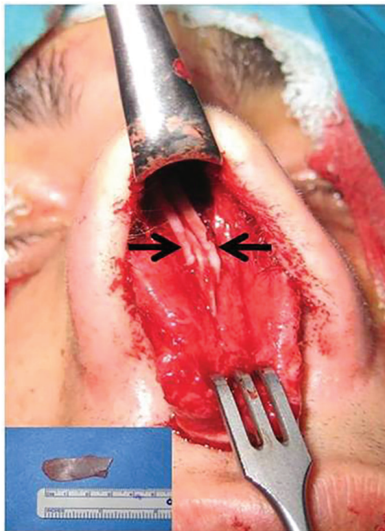
Fig. 1: Spreader grafts obtained from nasal septal cartilage (small figure) was placed symmetrically and bilaterally along the dorsal edge of the remaining septal cartilage (black arrows).

Septal cartilage was harvested, leaving a 10-mm L-shaped strut for nasal support. Two rectangular strips of cartilage were removed from the septum for use as spreader grafts and placed symmetrically and bilaterally along the dorsal edge of the remaining septal cartilage (Figure 1). All patients underwent surgery by the same surgeon using general anesthesia. Internal nasal splint or nasal packing was inserted at the end of the operation and removed 2 days after surgery. There were no serious complications in the postoperative period.