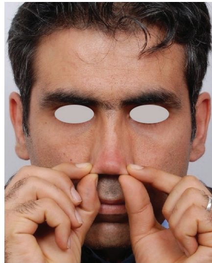
Fig. 2: Results of effective skin massage in male patient.