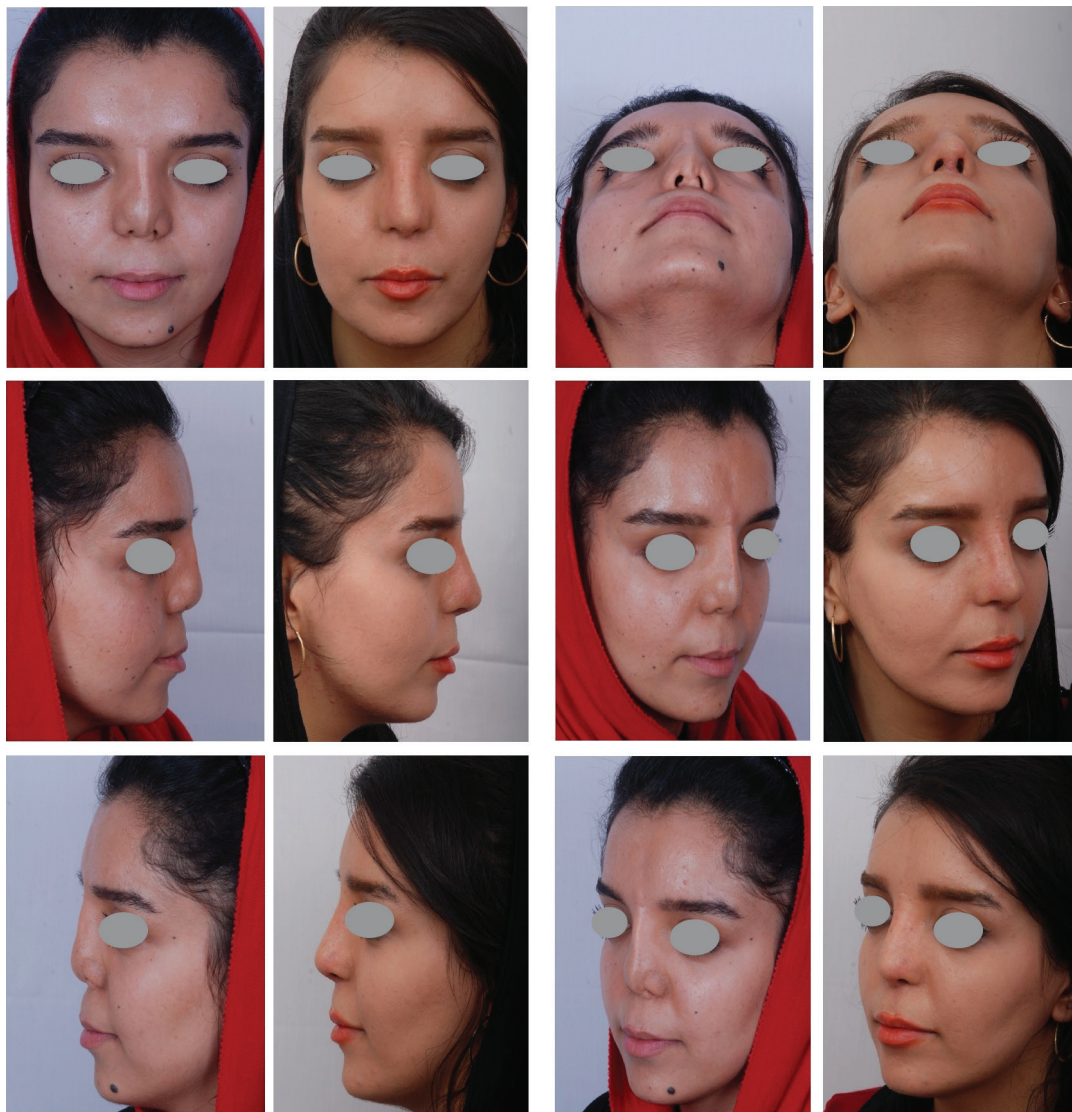
Fig. 3: Case of ultra-short nose (Binder's syndrome) with 3 previous operations in each pair of pictures the left one is pre-op and the right one is post-op. Results (8 months post-op) after nasal augmentation with grated cartilage + fascia from rib cartilage and rectus abdominis fascia and other different grafts for all parts of the nose. We have also used grated cartilage + fascia for augmentation of deficient nasal base and lower rim of piriform aperture.