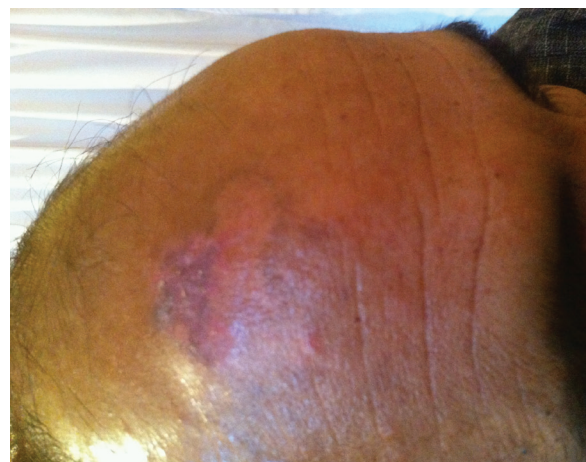
Fig. 3: Partially healed chronic ulcer.