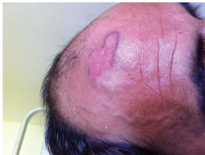
Fig. 1: Chronic non-healing ulcer on forehead.

All wounds heal in three stages: (i) Inflammatory Stage, occurring during the first