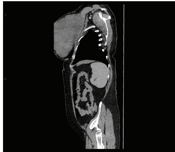
Fig. 1: CT revealed a large solid heterogeneous left breast mass going off the CT window measuring at least 20 cm in a single oblique measurement.

The patient underwent mastectomy and an immediate deep inferior epigastric perforator reconstruction. The mastectomy was challenging due to the peri-tumoral inflammation and increased vascularity (Figure 2A). Post-operatively early venous congestion necessitated re-operation; however medial flap necrosis was not avoided. Definitive histology showed a