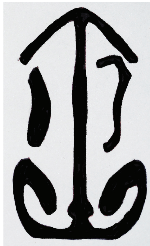
Fig. 4: An illustration showing the postoperative image.