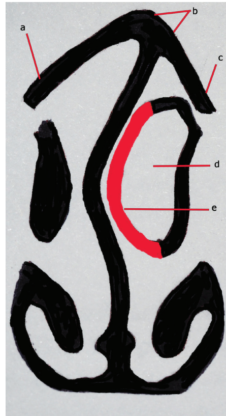
Fig. 3: An illustration showing the preoperative left middle turbinate pneumatization in crooked nose and operation plan (a: right double lateral osteotomy, b: paramedian osteotomies, c: left lateral osteotomy, d: pneumatized middle turbinate, e: medial wall of pneumatized middle turbinate).

Middle turbinate pneumatization is one of the most common anatomical variations of the middle meatus. 3 Three types of middle turbinate pneumatization were evident. In the first type, air cells were noted to pneumatize the vertical lamella of the turbinate. In the second type, air cells were noted to pneumatize the inferior or