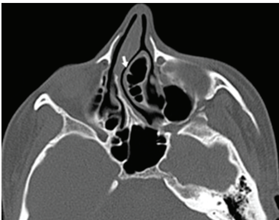
Fig. 2: Preoperative axial paranasal sinus computerized tomography scan (white arrow: left medial wall of pneumatized middle turbinate).

left single lateral osteotomy were performed in this case, Figure 5 and 6).