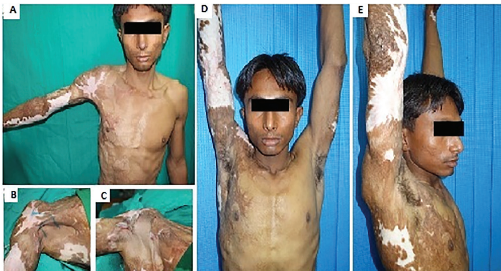
Fig. 2: A: Preoperative view of right axillary contracture type 1a; B: Preoperative marking of square flap; C: Sutured flaps after advancement of square flap and transposition of triangular flaps; D, E: Postoperative front and lateral view at 1.5 years follow up respectively showing full abduction of right shoulder.