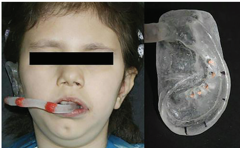
Fig. 1: A. 12-year-old female patient with right ear loss. Initial clinical presentation. B. anterior view.

An incision was made posterior to external