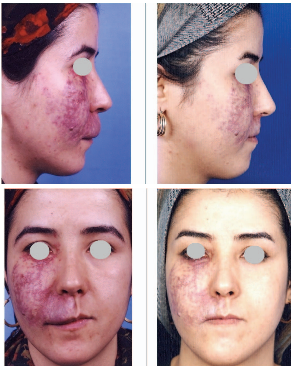
Fig. 3: A 34 years old lady with mixed capillary and venous malformation of right side of mid face and right side of lip (left). She received 6 injections of the combination of bleomycin, triamcinolone and epinephrine. Three injections with 1 month interval, 2 injections with 2 months interval, 1 injection 6 months later. Post-injection photos 1 year later (Right).