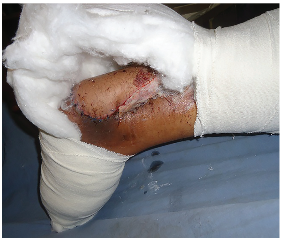
Fig. 2: The custom made back slab of plaster of Paris was designed to protect the flap and avoid any compression or pressure on the pedicle.