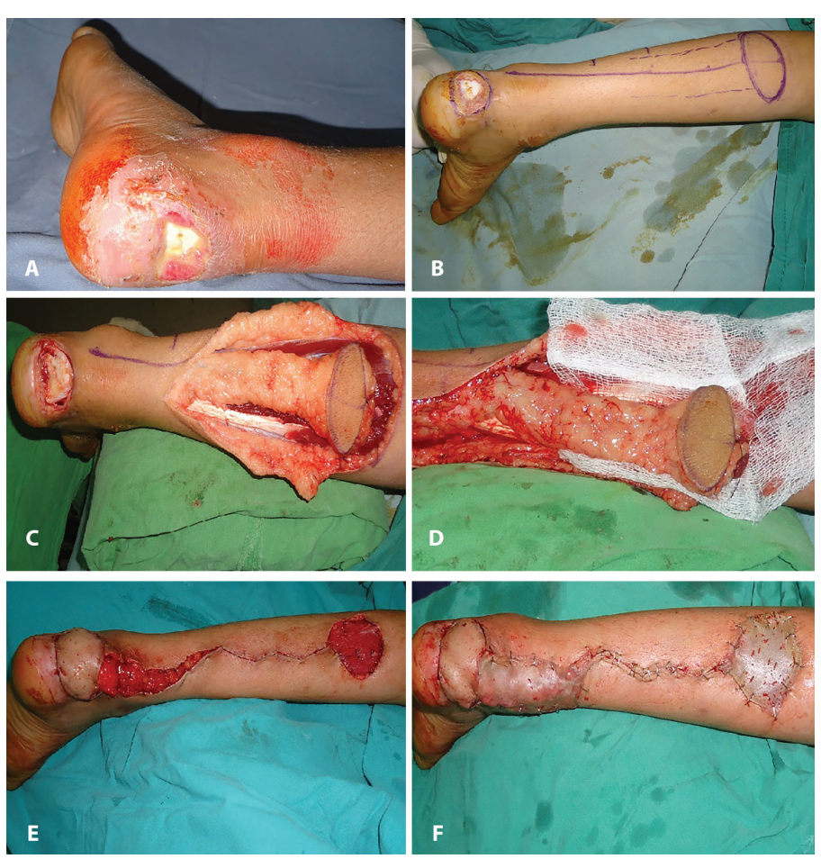
Fig. 4: (A): An adult female with hind-foot defect of four weeks duration. There was exposed tendo-Achilles. (B): Same patient as in Figure 4A, the markings for planned islanded flap. (C): Same patient as in Figure 4A and B islanded flap has been elevated on the adipofascial pedicle. (D): A close up view of the islanded flap and its adipofascial pedicle. (E): Flap transposed. (F): Completion photograph of the same patient as in Figure 4A through E.

Complex defects of the distal leg, ankle, heel and proximal foot may be caused by a variety of causes. For instance, trauma, tumor ablation, burn injury, release of contractures and pressure sore. There may be exposed bone, joint, tendons, ligaments or implants employed for fracture fixation. For the majority of such defects, the valid prudent reconstructive options were either