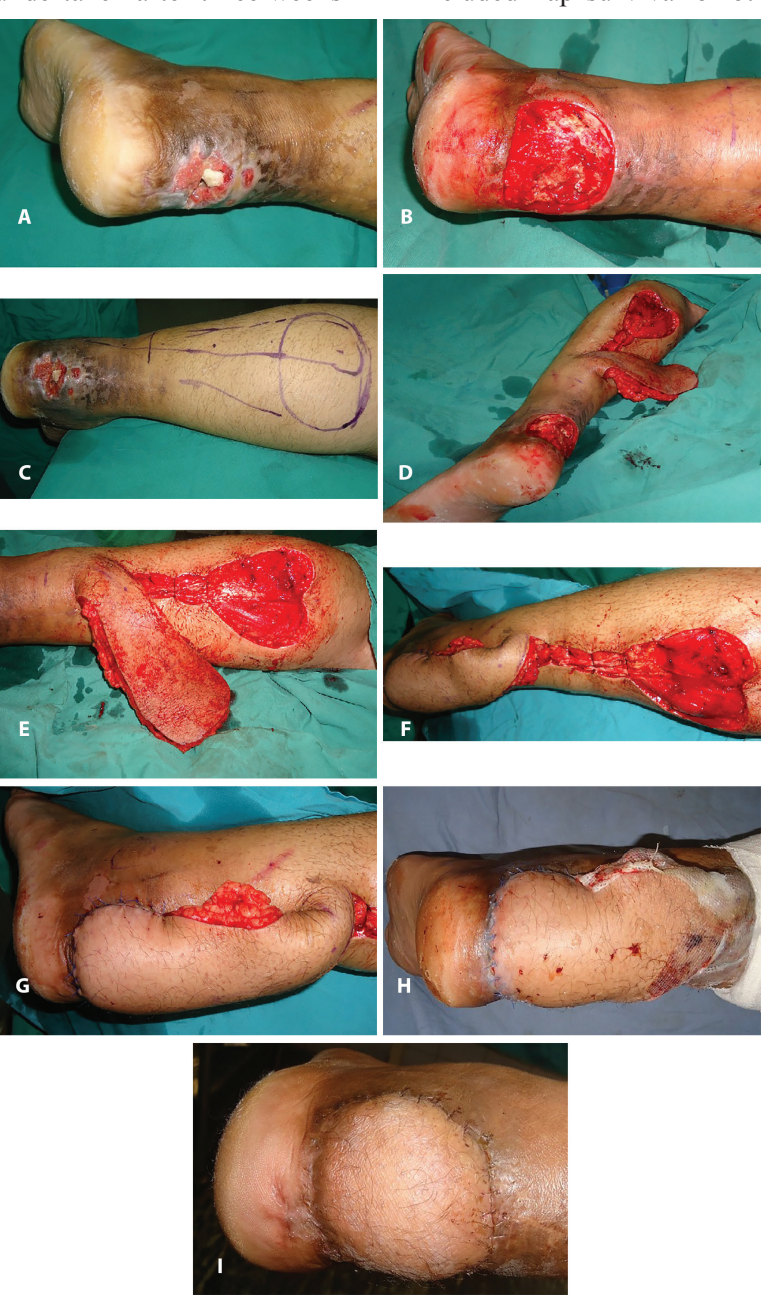
Fig. 3: (A): An adult male with post-traumatic hind-foot defect of the left foot. It is of three months duration. There was exposed tendo-Achilles and unhealthy tissue around the chronic defect. (B): Intraoperative photograph of the same patient as in Figure 3A following thorough debridement of the wound. (C): Intraoperative photograph of the same patient as in Figure 3A and B showing flap markings. (D): Same patient as in Figure 3A, B and C showing elevated interpolated flap. (E): Same patient as in Figure 3A through D showing elevated flap and the target defect. (F): Same patient as in Figure 3A through E with interpolated flap transposed onto the defect. (G): Intraoperative photograph of the same patient as in Figure 3A through F, a close up view of the flap. (H): 5th postoperative day of the same patient as in Figure 3A through G. (I): One month postoperative status of the same patient as in Figure 3A through G.

under local anesthesia. Full weight bearing was allowed by the end of 4<sup>th</sup> week after first operation. The data were analyzed statistically using statistical package for social sciences (SPSS, Version 17, Chicago, IL, USA) and various descriptive statistics were employed to calculate the objectives. The outcome measures included flap survival or otherwise, frequency