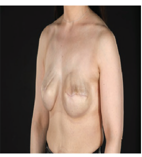
Fig. 1: Demonstrating the grading of rippling. Grade 3: Moderate degree of rippling seen at both rest and exercise. Grade 4: Persistent rippling causing gross deformity. Bra can cause impressions on the breast as seen in this patient.