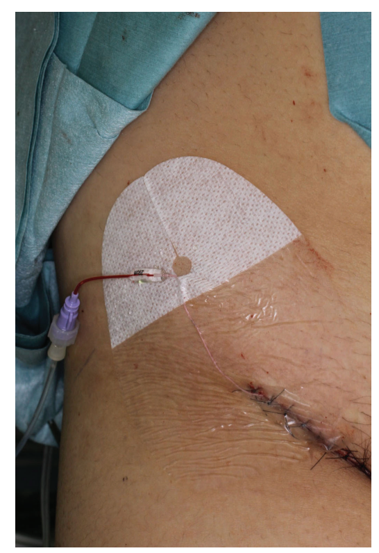
Fig. 2: Catheter was introduced from the incision of femoral region.