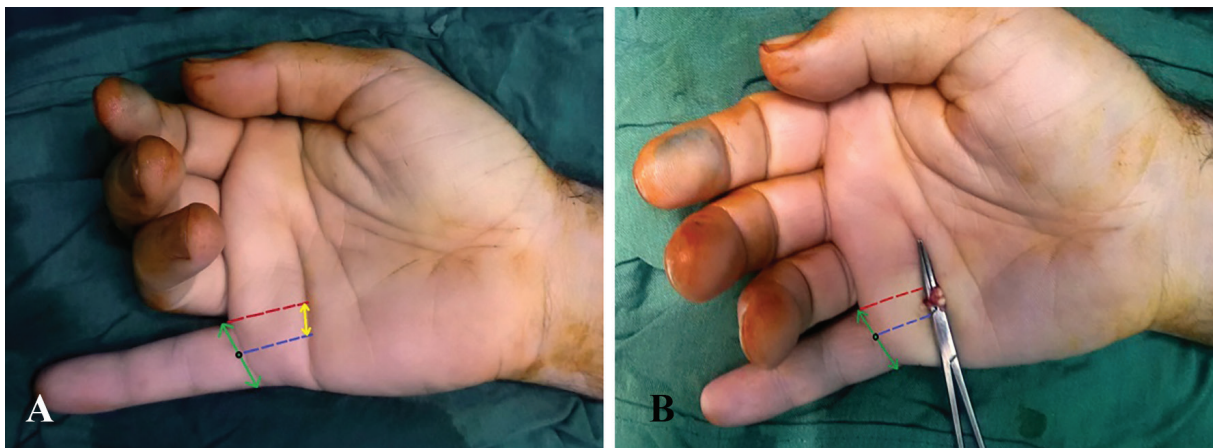
Fig. 2: A: The 22-year-old man suffered the deep flexor tendon rupture after repairing of the finger injury in another center. Blue dash line: The mid-axial lines, red line: the ulnar border distance of little finger, green arrow: the foot print and the yellow arrow: The location of proximal flexor tendons. B: The second patient after detection of the deep flexor tendon.