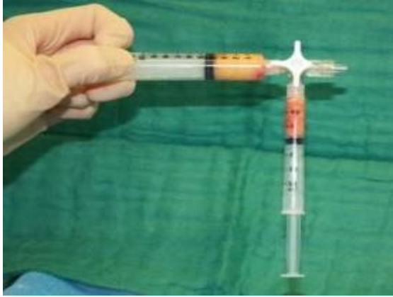
Fig. 3: Purified fat transfer from 10 ml Luer Lock® syringe to a 1 ml Luer Lock® syringe through a 3-ways connector.