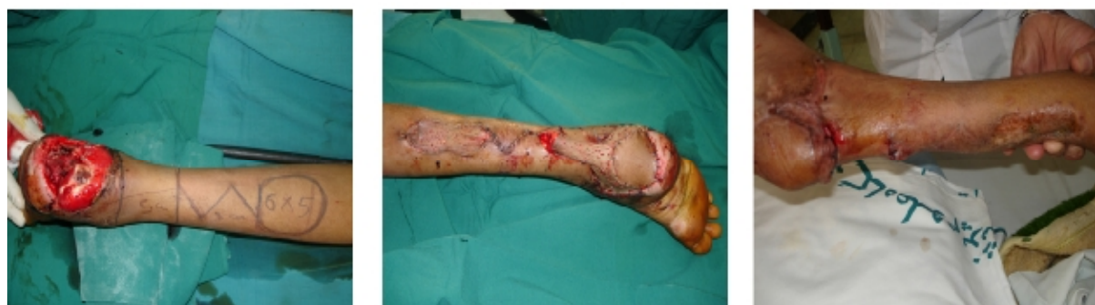
Fig. 3: A: Large heel area soft tissue defect and RISF design (Flap size is 6x5 cm). Middle: Flap inset and donor site reduction with substratum horizontal matters suture. Right: Scar size at the time of pedicle division (After 3 months).