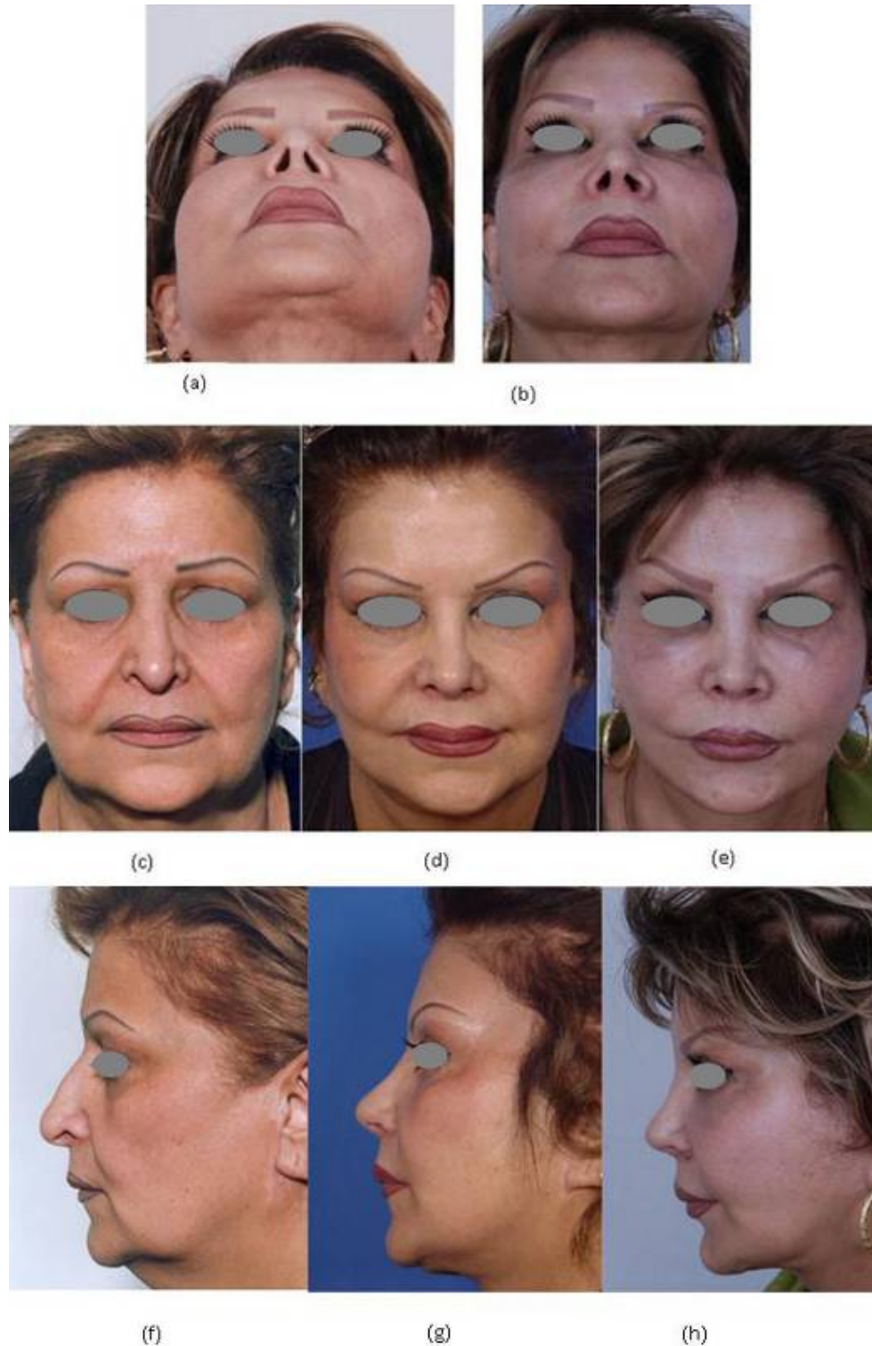
Fig. 4: A lady presenting with asymmetry in nostrils in addition to dissatisfaction with previous rhinoplasty and face-lift, (a) before, and (b) after secondary rhinoplasty, reconstruction with a small composite graft, face-lift and lipoplasty, on frontal view. Additional images show frontal views of her, when presenting for the first time (c), after secondary rhinoplasty and face-lift (d), and three months after lipoplasty and implementing a composite graft on the right ala (e). Images (f), (g) and (h) show the same individual on profile view.