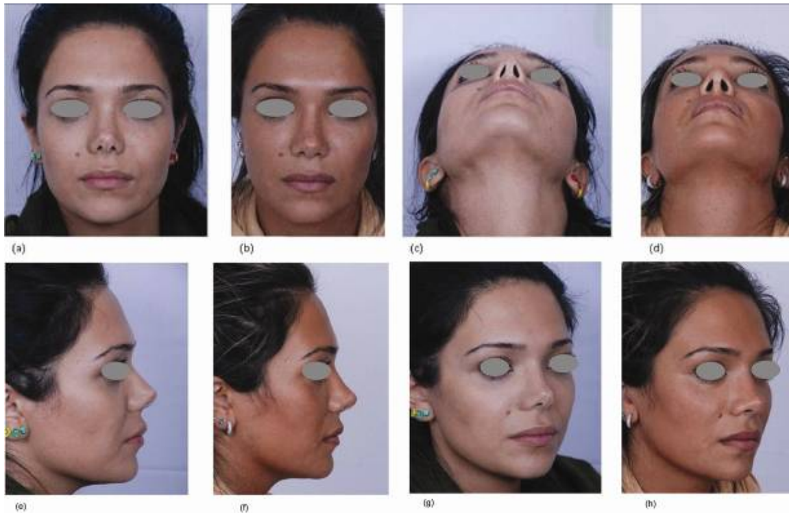
Fig. 5: A young lady who had undergone two previous rhinoplasties, and the surgical and unnatural appearance of nasal tip and nostrils was her main complaint. Images (a) and (b) show her after tertiary rhinoplasty and composite grafting, on both sides, on frontal view. Figures (c) and (d) show her on basal view (e) and (f) show profile view (g) and (h) show three-quarter view.

needed to reconstruct alar rims in 9 patients who had relatively larger defects. We observed that in 5 cases the grafts had excellent take. In 3 individuals the grafts had acceptable take but in one patient, who was a male smoker, the graft failed to take. It has been suggested by other authors that auricular composite graft used for reconstruction of the alar rim should not be larger than 1.5 to 2 centimeters in diameter 17 to ensure reliable revascularization. This supports our results which showed that in 9 patients who needed large composite grafts, only 5 patients had excellent graft take. Where as all 47 patients with small grafts had excellent graft take. The main advantage of composite graft is that it can be performed in a single, fast surgical procedure with excellent contour correction. 12 The main disadvantage of composite graft is that its use for large defects (larger than 2 centimeters) has not been recommended, and other therapeutic modalities such as nasolabial or forehead flap can be performed for these defects. 18,19 Moreover, the