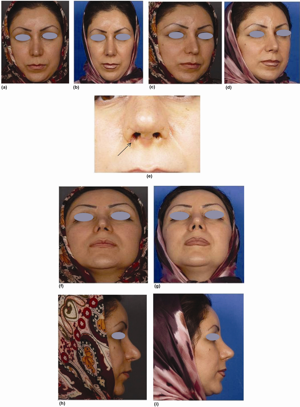
Fig. 3: A lady who complained of asymmetric nostrils and other deformities following rhinoplasty. Images (a) and (b) show her on frontal view, before and after tertiary rhinoplasty and surgical correction with small composite grafts on the right alar rim, respectively. Figures (c) and (d) show the same patient, on three-quarters view. Figure (e) shows a close-up view of the same patient 10 days after surgery. The site of graft is indicated by an arrow. Figures (f) and (g) show basal view (h) and (i) show profile view.