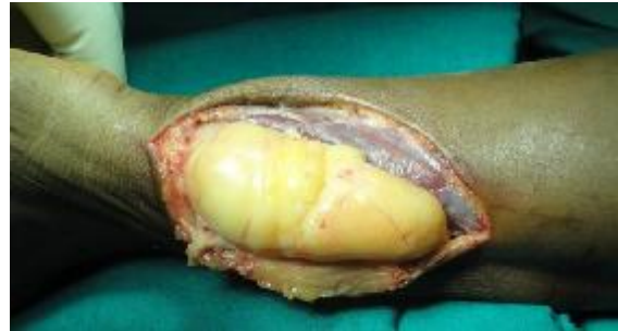
Fig. 3: Lipomatous appearance of the tumor.

block with tourniquet control. Longitudinal incision was made on the ulnar border of the distal forearm. The FCU was stretched, and displaced outwards. On reflecting the FCU, the mass was exposed (Figure 3).