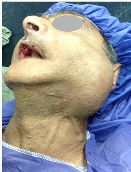
Fig. 1: A 64-year-old man with a history of two episodes of mandibular fracture 3 months and 12 months ago was referred to the trauma center with chief complaint of left side neck bulging.

Under general anesthesia, in proper position, an incision was made on the left side of the neck. Proximal control was applied on the common carotid using an umbilical tape. Then aneurysmal mass was opened meticulously. Large clot was evacuated and a pseudo-aneurysm was detected between left external carotid branch and left facial vein that was excised (Figure 3). The left facial vein was ligated and any perforation of the left external carotid branch was repaired with prolene 6-0 (Figure 4). The wound was closed and the patient was discharged uneventfully. All procedures performed were in accordance with the ethical standards of the institutional and national research committee and with the 1964 Helsinki declaration and its later amendments or comparable ethical standards. Informed consent was obtained from the patient