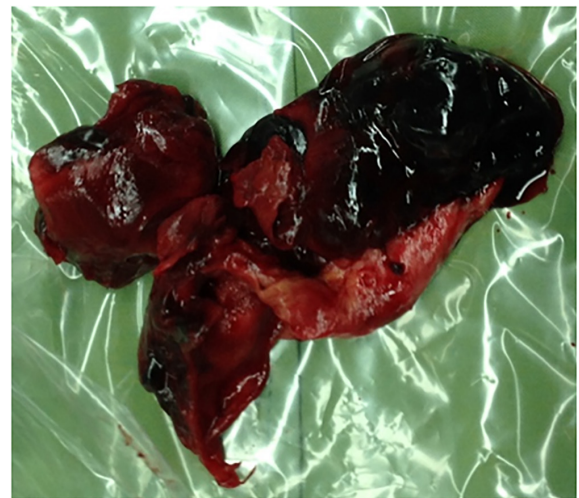
Fig. 3: A pseudo-aneurysm was detected between left external carotid branch and left facial vein that was excised.