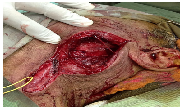
Fig. 4: The left facial vein was ligated and perforation of the left external carotid branch was repaired with prolene 6-0.

AV fistula on the other hand is a rare complication after mandibular fracture that could be fatal if left untreated as the result of massive blood loss after tooth extraction or attempts to remove or biopsy the lesion. 6