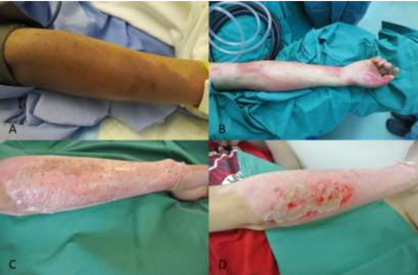
Fig. 1: Case 1: (A): Right forearm burns on presentation. (B): The lateral aspect (1% TBSA) was poorly blanching after de-blistering and subsequently tangentially excised. Biobrane™ was applied to all burns (excised and non-excised). (C): All wounds were healing well on POD 10. (D): Epithelization was complete by POD 15.