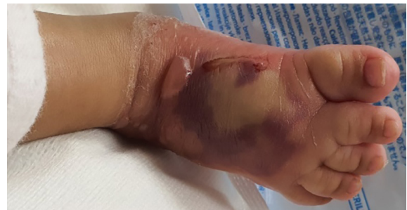
Fig. 1: Extravasation injury of the dorsum of right foot following 10% dextrose IV infusion.

The dressing was repeated every day for a week, and after that, the patient was transferred to another facility and unfortunately was lost to follow up. Based on the clinical features, we can grade extravasation injuries as mild, moderate and severe, which will guide us in managing these injuries (Table 1). We have proposed an algorithm in the management of extravasation injuries based on the grade of injury too (Figure 3).