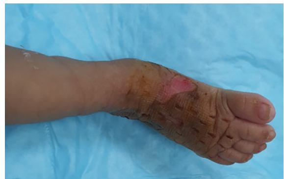
Fig. 2: Appearance of the right foot after 1 week showing almost complete resolution with a small area of desquamation on the medial aspect which healed conservatively.