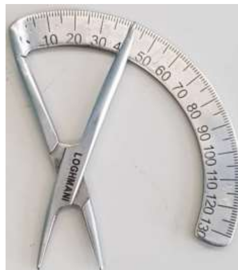
Fig. 1: Researcher-made device for measuring LCDA

incisions were made, and the nasal flap was elevated in the subperichondrial plane.