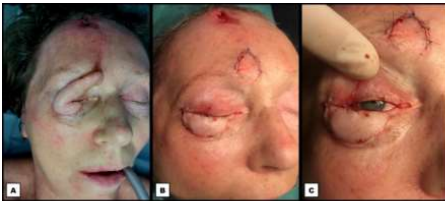
Fig. 4: Second stage of the periocular reconstruction. A: Intraoperative photograph prior to release of the pedicle of the forehead flap showing an adequate flap ingrowth and a favourable healing of the donor site. B: Intraoperative photograph after release of the pedicle and lateral inset of the forehead flap after subcutaneous thinning and fixation to the lateral canthal ligament. The palpebral mucosa of the lower eyelid is advanced and sutured to the superolateral border of the flap. The frontal donor site is closed with a V-Y plasty. C: Intraoperative photography showing the passive aperture of the right eye after partial lateral canthotomy for scar release.

The lateral part of the forehead flap was then fixed into the remaining defect with subcuticular Monocryl Plus® poliglecaprone 25 5-0 sutures. It was also sutured to the lateral canthal ligament with an Ethilon® nylon 6-0 suture to provide the flap with a favourable contour and suspension. The mucosa of the lower eyelid was then partially advanced to reach the new lateral eyelid margin. All wounds were further closed with Prolene® polypropylenesutures 6-0 (Ethicon US, LLC) sutures and were covered again with nitrofuril or tobramycine/dexamethasone ointment and a grease gauze (Figure 4).