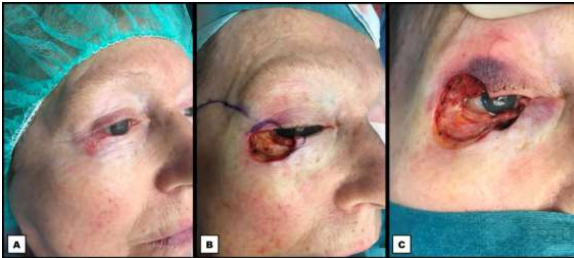
Fig. 1: Right periocular zone prior to reconstruction. A: Preoperative photograph showing the basal cell carcinoma located laterally on the lower eyelid. B: Intraoperative photograph showing the periocular defect after the first tumour excision with positive section margins. A corneal protector is in place. C: Intraoperative photograph showing the periocular defect after the second tumour excision with negative section margins. Whilst passively elevating the upper eyelid, a full thickness defect of the lower and upper eyelid, and a defect of the lateral canthus is shown.

was effectuated five days later in a phased fashion until intraoperative frozen sections confirmed negative specimen edges. This resulted in a defect not only comprising of the anterior and posterior lamellae of the lower eyelid, which were already removed during the first stage, but also of the lateral canthus and the lateral upper eyelid including its lid margin. While awaiting the definitive pathology report, the wound was left open after each stage, protecting the eye with a tobramycin/dexamethasone ointment (Tobradex, Novartis Pharma NV, Vilvoorde, Belgium). The final histopathological examination confirmed the absence of tumour cells in the section margins, allowing reconstruction (Figure 1).