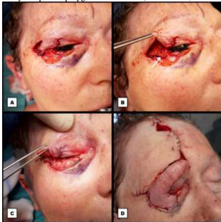
Fig. 2: First stage of the periocular reconstruction. A: Intraoperative photograph showing the modified myocutaneous Tenzel flap advanced into the defect of the upper eyelid to reconstruct the anterior lamella. Posterior to this flap lie the superior component of the Y-shaped periosteal and temporal fascia sling, as well as the advanced palpebral mucosa which is sutured to the inferomedial border of the flap. B: Intraoperative photograph showing the inferior component of the medially hinged periosteal and temporal fascia sling (arrow) by elevating the modified Tenzel flap with forceps. C: Intraoperative photograph showing the autologous cartilage graft from the right concha sutured into the defect of the lower eyelid to reconstruct the posterior lamella. The modified Tenzel flap is elevated with forceps. Posterior to the cartilage graft lies the advanced palpebral mucosa which is sutured to the superior border of the graft. D: Intraoperative photograph showing the interpolated paramedian myocutaneous forehead flap transposed onto the cartilage graft to reconstruct the anterior lamella of the lower eyelid. Conventional closure of all donor sites with a small frontal defect remaining, left open to heal secondarily.

Analogous to the upper eyelid, a minor palpebral conjunctiva advancement, was performed to posteriorly cover a chondral graft, which was added to reconstruct the posterior lamella of the lower eyelid. This chondral graft, with inclusion of the perichondrium to ensure ingrowth, was obtained from the concha of the right ear through a retroauricular incision. The graft was tailored to fit the defect and was sutured anterior from the conjunctiva into place with Ethilon® nylon 6-0 sutures to the lateral margin of the remaining tarsal plate of the lower eyelid and to the lateral orbital rim. Laterally, the inferior component of the Y-shaped hinged turnover flap was sutured to the cartilage as well with the same suture material, to provide suspension to the lower eyelid. In order to reconstruct the anterior lamella of the lower eyelid; an ipsilateral myocutaneous paramedian forehead