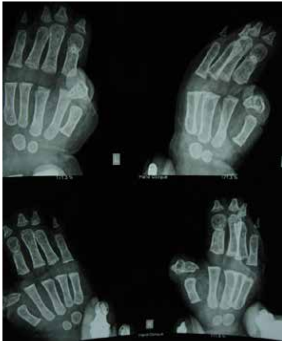
Fig. 4: Digital x-ray of both hands (AP and oblique views).

sided hemicoronal suture with radiologic confirmation of frontal plagiocephaly by cephalometric analysis. Right eye was found to be proptotic with shallow harlequin orbit due to elevated ipsilateral sphenoidal ridge. The ventricles were mildly dilated. Digital X-ray of hands (Figure 4) and feet corroborated the clinical findings of syndactyly with symphalangism. The thumbs showed presence of radially deviated