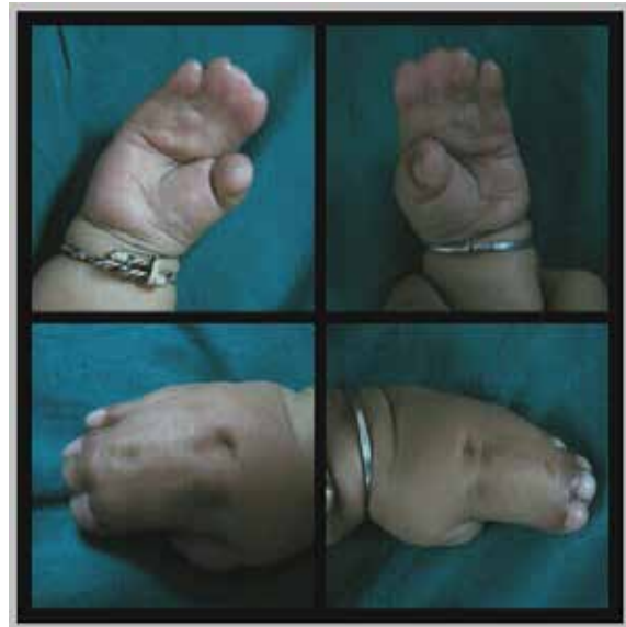
Fig. 2: Clinical photographs of hands: Upper left-right hand palmar, upper right-left hand palmar, lower left-right hand dorsal, lower right-left hand dorsal.

Both upper limbs showed (Figure 2) symmetric complete simple syndactyly of