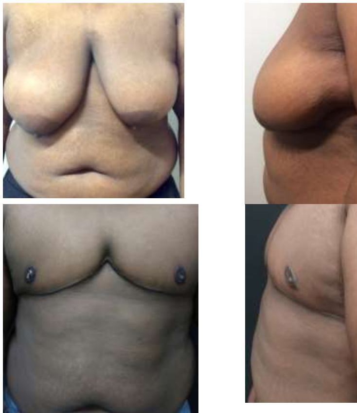
Fig. 1: 22-year-old FtM patient with a BMI of 40.62 kg/m 2 and D cup breasts with grade 3 ptosis. Anterior (A) and left lateral (B) preoperative photos. Weight of right and left mastectomy specimens were 1317g and 1048g, respectively. An inframammary incision with lateral extension was utilized. Anterior (C) and left lateral (D) at 11 wk post operation. There were no complications.

Additionally, we preferred the addition of a lateral extension of the inferior incision particularly in patients with poor skin elasticity, and Grade 2-3 ptosis. This technique was frequently utilized in this study given that the majority of our FtM patients fit into this categorization. A combination of surgeon experience and literature regarding breast reshaping in the post-bariatric surgery population motivated the adoption of this approach. Bariatric literature commonly references lateral extension of the Wise pattern for augmentation or mastopexy to correct lateral thoracic skin redundancy or “side rolls” 7-9 . With a similar goal of improving chest contouring in our patients, lateral extension of the inferior incision allows for resection of excess lateral chest wall skin to achieve further improved aesthetic outcomes of chest wall masculinization in obese FtM patients.