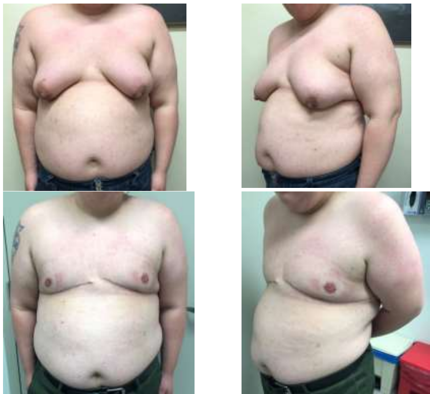
Fig. 2: 27-year-old FtM patient with a BMI of 40.31 kg/m 2 and C cup breasts with grade 3 ptosis. Anterior (A) and left lateral (B) preoperative photos. Weight of right and left mastectomy specimens were 197g and 675g, respectively. Anterior (C) and left lateral (D) at six weeks post operation which utilized an inframammary incision with lateral extension. There was loss of his left central areolar nipple graft managed conservatively with application of Santyl.