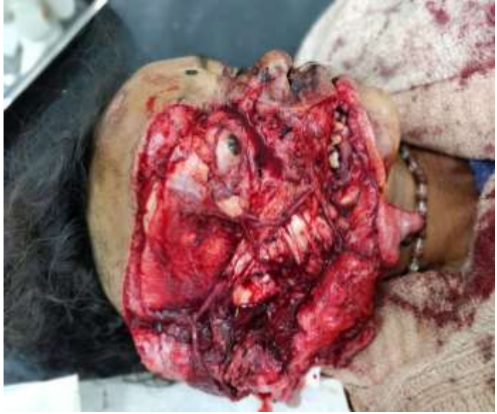
Fig. 2: Preoperative picture lateral view