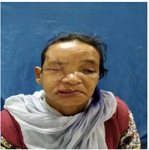
Fig. 6: Post operative image frontal view