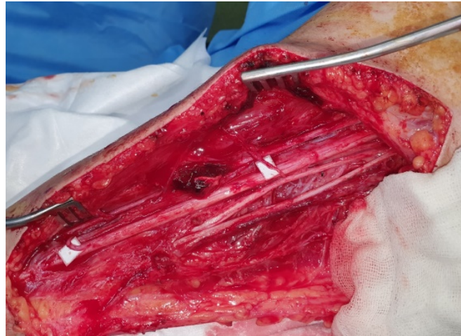
Fig. 1: First surgery in supine position.

Surgery scene as demonstrated by white backgrounds nerve fascicles transferred from the ulnar nerve to the biceps brachii of the musculocutaneous nerve and from the median nerve to the brachialis branch of the musculocutaneous nerve.