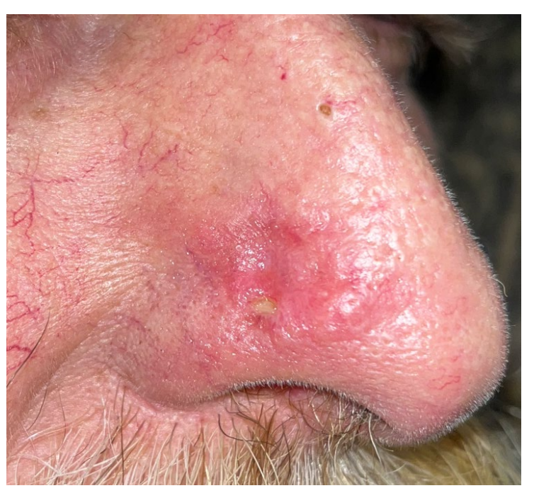
Figure 3: Patient at postoperative week 8. As is shown in the figure, there was excellent healing and no signs of graft rejection.

plain were used every 3 mm to suture the graft to the surrounding skin. A "sandwich" silicone splint was secured in the nasal sidewall with a 5-0 nylon full-thickness suture. The skin containing part of the composite graft was left uncovered for monitoring. Finally, the PRP was injected into the surrounding skin with a 25-gauge needle. The auricular skin defect was repaired with a full-thickness skin graft obtained from the skin of the right neck (Figure 2b).